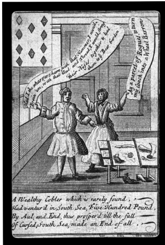
Figure 1.4 Ten of Diamonds card from the South Sea deck

But by far the greatest recrimination has always been reserved for the “upstarts”—the ordinary people who breached the norms of class and gender to engage in financial speculation. The excoriation of the masses was illustrated in another card from the South Sea deck represented in figure 1.4.