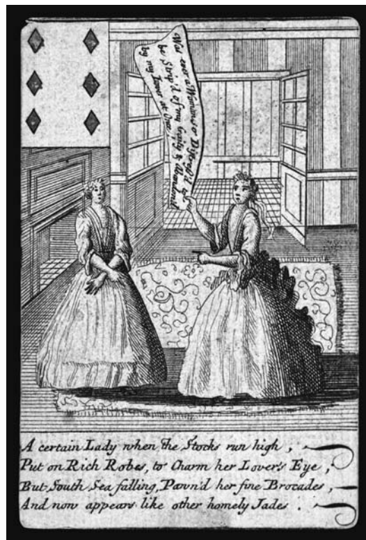
Figure 1.2 Six of Diamonds card from the South Sea deck

The use of humor remains to this day the primary form of social protest in the wake of financial scandal. For example, the travails of Martha Stewart have generated endless jokes, including a parody of her flagship magazine, titled Martha Stewart Living Behind Bars , which features a recipe for “jailhouse chili” and tips on how to decorate a prison cell. 46 See figure 1.3, which compares this to a similar image from a popular broadside created just after the South Sea Bubble, depicting a wealthy, bewigged Englishman languishing behind bars as a result of his financial malfeasance.