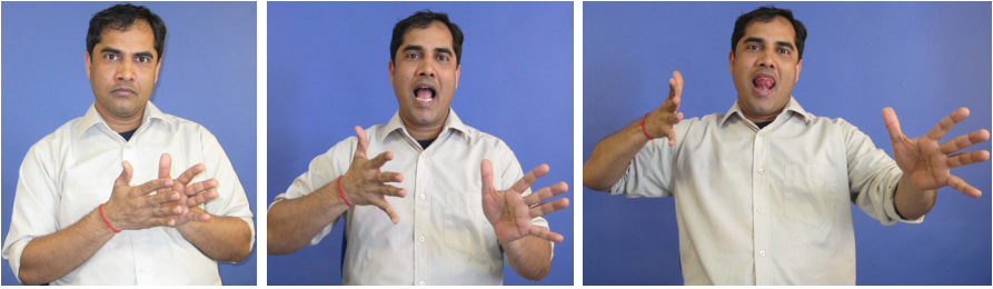
Figure 3. The numbers 100, 1,000 and 100,000 in APSL

Both MarSL and APSL also use subtractive numerals, though in quite different ways (see Zeshan et al., in prep, for details). In MarSL, a number such as 18 may be expressed as 20–2 (see Figure 4). The subsystem in MarSL has a more restricted scope of use (up to a maximum of –5), but subtractive numerals in APSL are much more productive, with numbers such as 30–2 for 28, 200–5 for 195, or 50–2 for 48 found with some frequency in the data. Subtractive numerals are known to occur in some spoken languages, but were previously undocumented in sign languages.