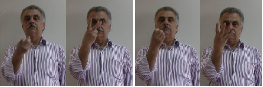
Figure 1. The numbers 40 and 80 in MarSL

The number 20 is also used, along with the number 50, as a base from which to construct larger numerals. In Chican Sign Language, these numbers are added successively, so that, for instance, 80 is expressed as 50+20+10 . Thus 50 and 20 are both used as additive bases in Chican Sign Language (see Figure 2). It is striking that independently of each other, all three sign languages have developed a system that uses 50 as a base number.