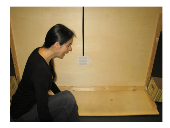
Fig. 3. Photograph showing the experimenter's position behind the barrier during the test phase in Study 2.