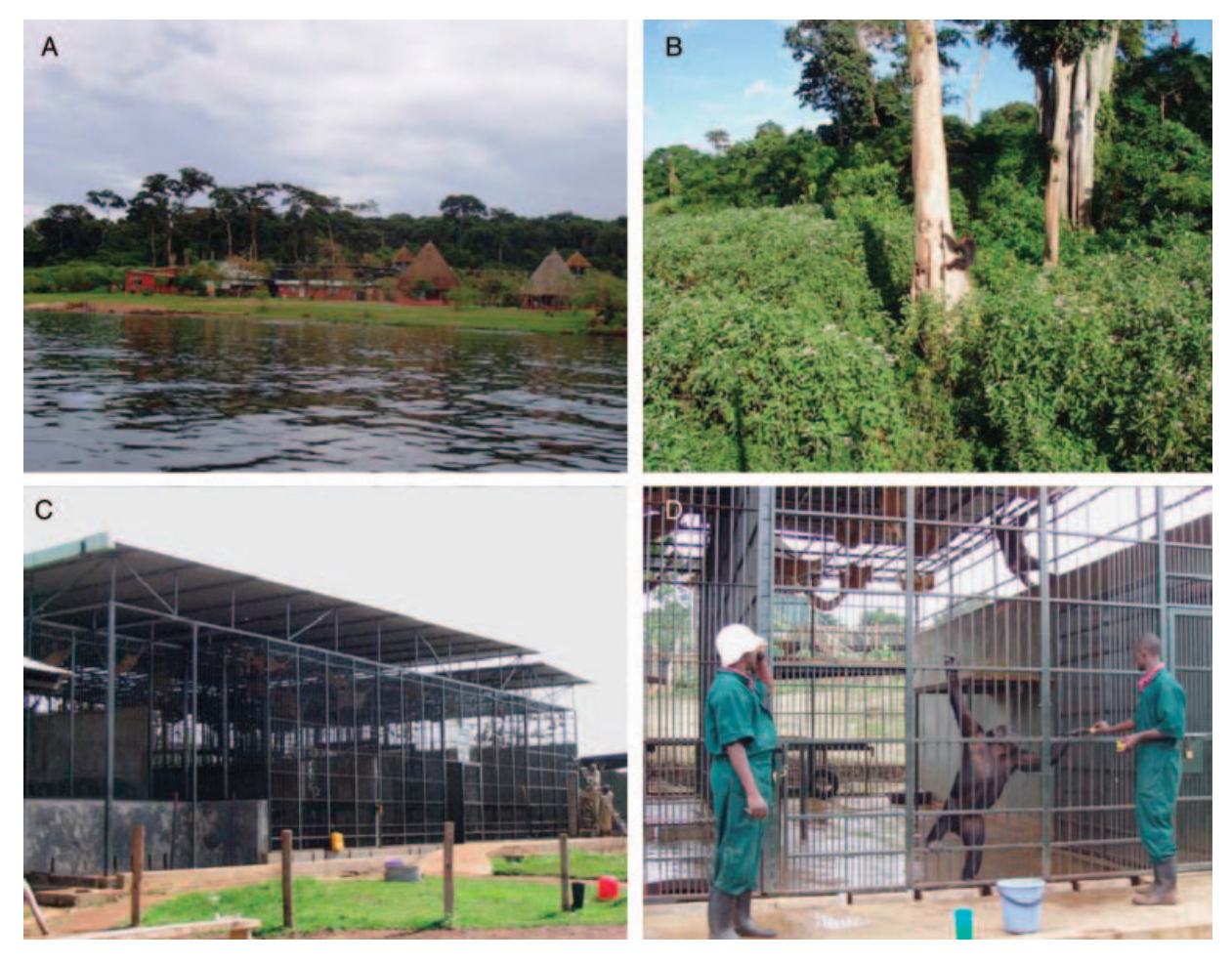
Fig. 3. A 40-hectare (100-acre) island sanctuary for chimpanzee orphans—a result of the illegal bushmeat trade. Ninety-five percent of the island (A) is primary tropical forest in which the chimpanzees can roam freely. A juvenile chimpanzee (B) climbs a tree before disappearing with its other 40 group members into the forest for the day. At night the sanctuary apes sleep in hammocks in large indoor enclosures (C) where they are provisioned and protected from the weather. In the morning, individuals can volunteer to play problem-solving games (D) by allowing keepers to separate them from the group, after which they are let out onto the island.

Bonobos and chimpanzees diverged from each other around 2 million years ago and differ in morphology, behavior, and perhaps even emotions and cognition in important ways. Bonobos are female dominant, with females forming tight bonds against males through same-sex socio-sexual contact that is thought to limit aggression. In the wild, they have not been seen to cooperatively hunt, use tools, or exhibit lethal aggression. Chimpanzees are male dominant, with intense aggression between different groups that can be lethal. Chimpanzees use tools, cooperatively hunt monkeys, and will even eat the infants of other chimpanzee