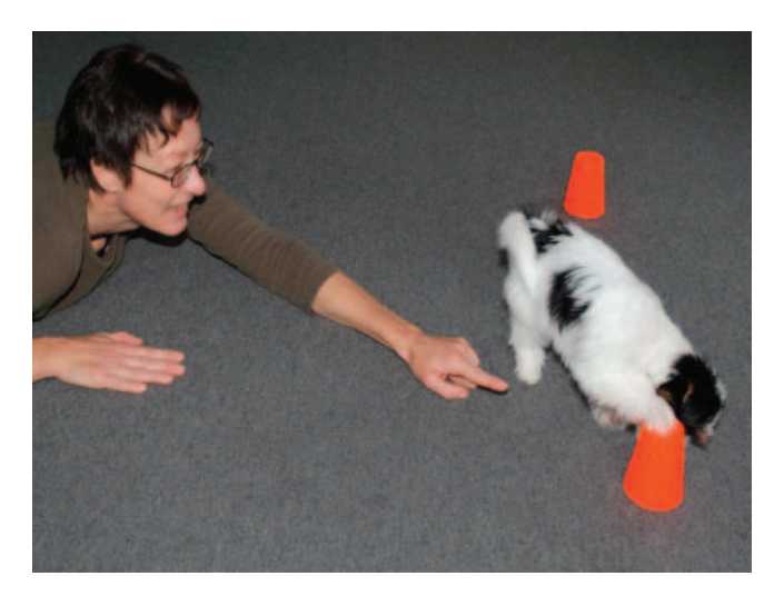
Fig. 1. Basic test of an animal's (in this case, a dog's) ability to use human behavioral cues to find hidden food. An experimenter places food so that the dog sitting across from her does not know under which cup it is hidden. Then the experimenter points in the direction of the correct cup and lets the dog choose a cup. (Dogs are more skilled at this task than are chimpanzees.)

Identifying unique psychological features of our species' evolutionary past is merely the first step in reconstructing human cognitive evolution. The second and toughest evolutionary challenge is answering the question, what selection pressures