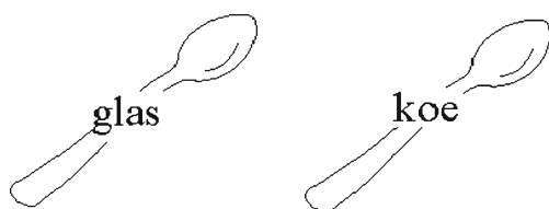
Fig. 2 Example stimuli for the semantically related (left) and unrelated (right) conditions (target: lepel [spoon]; distractors: glas [glass], koe [cow])

booklet to refer to the pictures. Then they were handed a second booklet showing only the pictures and were asked to name them. Errors were immediately corrected by the experimenter. This familiarization phase was followed by the four test blocks, which were separated by short breaks. Participants were instructed to name the pictures aloud as quickly and as accurately as possible.