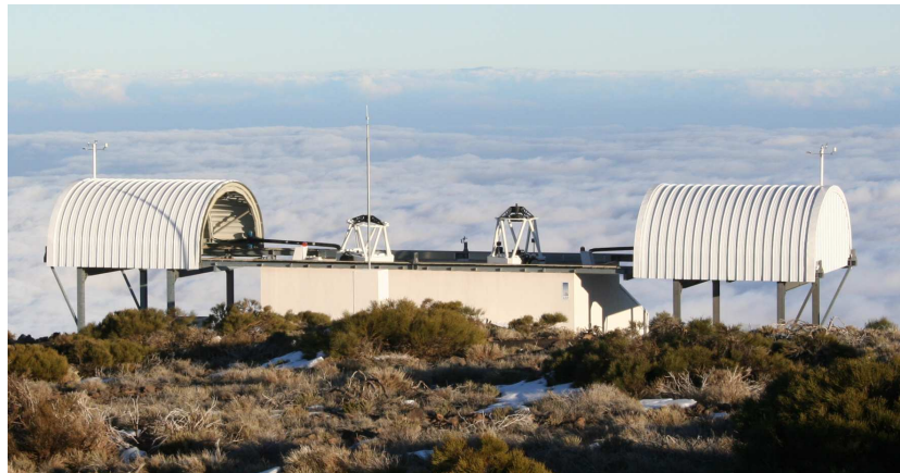
Figure 2: Robotic telescopes STELLA-I and STELLA-II at Tenerife.

The integration of robotic telescopes into a worldwide network can provide important advantages for astronomical observations which require the coordinated participation of multiple telescopes. For example, multi-wavelength campaigns or the continuous monitoring of transient astronomical objects currently