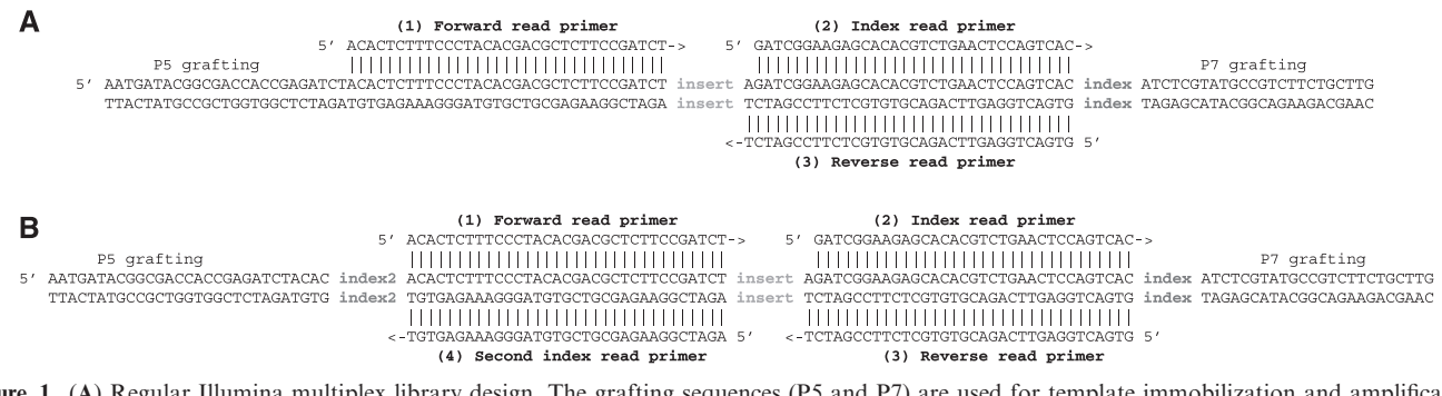
Figure 1. (A) Regular Illumina multiplex library design. The grafting sequences (P5 and P7) are used for template immobilization and amplification. Three distinct sequence reads (forward read, index read, reverse read) are primed from different adapter sites. (B) Double-index library design with an additional index incorporated into the second adapter. Here, four distinct sequence reads are performed.

To avoid false-assignments of sequences to samples, previous studies have focused on generating highly distinguishable index designs (6,8,9,16), i.e. requiring several sequence changes before one index sequence is converted into another valid index sequence. This should efficiently reduce the number of index conversions due to errors in sequencing, library amplification or oligonucleotide synthesis. For example, assuming an error rate of 0.5% per position, an edit distance of three would correspond to a false-assignment probability of 4.31E-06 for 7-nt indexes ( \sim 172 per 40 million sequences in a lane of an Illumina Genome Analyzer IIx flow cell) under a simple binomial error distribution model. This is much lower than required for most applications. Another possible source of sample misidentification is cross-contamination of indexes by the oligonucleotide manufacturer or during later handling. This can be caused, for example, by sequential purification of different indexing primer/adapter oligonucleotides on the same high performance liquid chromatography (HPLC) column after synthesis. Even though columns are washed between oligonucleotides, low levels of carryover contamination may be difficult to prevent.