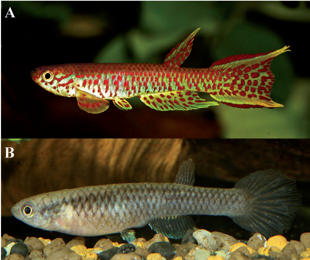
Fig. 4. A) Male of Aphyosemion elegans , commercial import (2006) from the Tshuapa River near Boende, not preserved. B) Female Aphyosemion elegans , commercial import (2006) from the Tshuapa River near Boende, not preserved.

tudinal series 28–30, with two scales posterior to hypural plate; seven transversal scales, 12 scales around caudal peduncle.