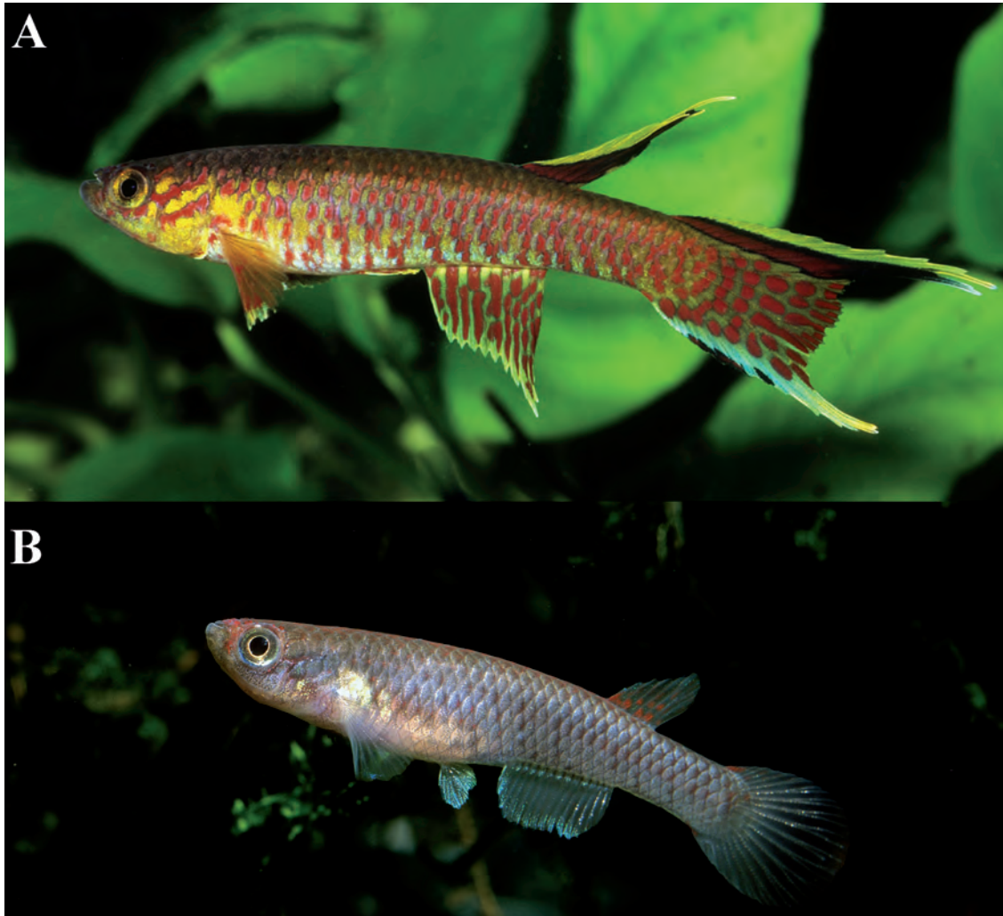
Fig. 2. A) Male of Aphyosemion pseudoelegans , collected at Boende in May 2002, not preserved. Digital copy of a colour slide. B) Female of Aphyosemion pseudoelegans , collected at Boende in May 2002, not preserved. Photographed by H. Ott three months after collection.

Holotype. MRAC 178016, male, 33.3 mm SL, Democratic Republic of Congo, Équateur Province, Tshuapa Basin, Boende, 0°14'S, 20°50'E, coll. P. Brichard, 1969.