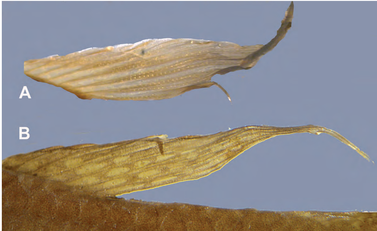
Fig. 3. Dorsal fin of male specimens preserved in ethanol. In these specimens the red pigmentation is lost, but the difference in colour pattern between the two species is still visible. A) A. pseudoelegans , MRAC 80709–80777, Bokuma, with plain greyish to brownish fin tissue. B) A. elegans , MRAC 93724, Bokuma, fin tissue with light dots which are the remains of the former red pigmentation.

Aphyosemion congicum has only a few red dots on the flanks and an almost dotless anal fin versus many red dots or bars on flanks, anal fin with many red dots or inter radial red stripes.