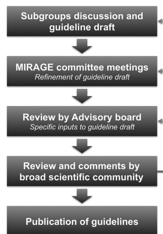
FIG. 1. Process used within the MIRAGE project for the development of guidelines. The multistep process established for this purpose includes drafting within the subgroups, refinement within the entire working group, and reviews by the advisory board. Finally, the scientific community is invited to comment so as to achieve broad agreement and minimize potential mistakes and misunderstandings.

The MIRAGE Project —In 2009, at the Workshop on Analytical and Bioinformatic Glycomics, organized by the Consortium for Functional Glycomics, an international group of glycoscientists concluded that there is an urgent need for the standardization of data reporting in this area (6). Standardiza-