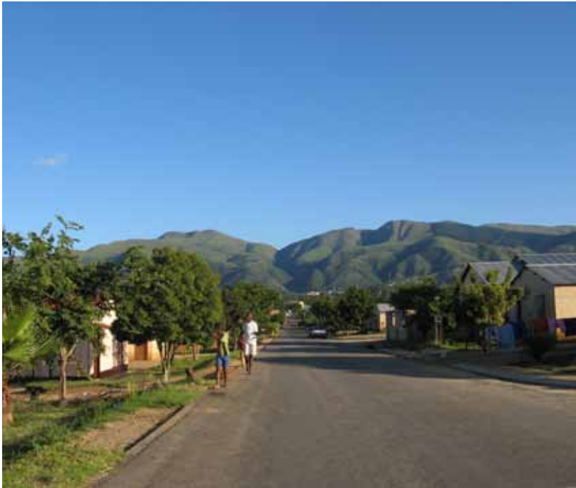
Photo 12: Makhonjwa Mountains seen from eMjindini Township, Barberton (2008)

In many respects eMjindini/Barberton constitutes a ‘micro-cosmos’ of the South African society in the configuration of a small town. Economic activities of the area represent a cross-section of the South African economy with active mines, large- and small-scale farms, a small industrial branch as well as financial and business services (Umjindi Municipality 2012: 54). This constitutes a remarkable diversity for a small town and is probably one of the reasons for its relative stability despite the closing down of a number of gold mines in the last years. The official statistics, however, reflect only one part of the actual economic activities. Especially the township, but not exclusively, features an important and essential ‘informal’ economy. Presumably all inhabitants participate in this sector in one or the other way. This includes taxi and transport companies, small businesses like tuck or spaza shops, informal drinking places ( shebeens ), garages, barbers and hairdressers. Further, it includes services such as room letting and traditional healing, as well as criminal activities like smuggling marijuana from Swaziland, poaching, ‘illegal’ gold mining and trading with stolen commodities.