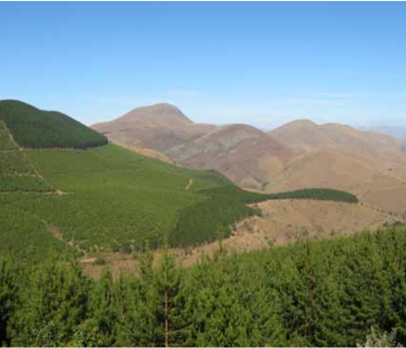
Photo 10: Pine tree plantations in a wintry scene, Makhonjwa Mountains (2009)