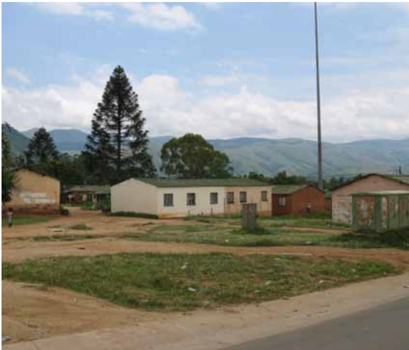
Photo 9: Former hostels and now family units, eMjindini Township, Barberton