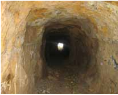
Photo 10: Light at the end of the tunnel, Piggs Peak gold mine (2009)