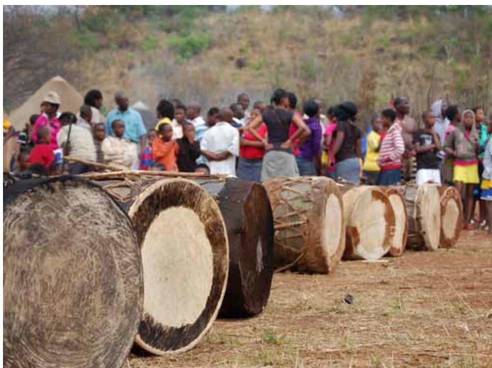
Photo 5: The musical instruments