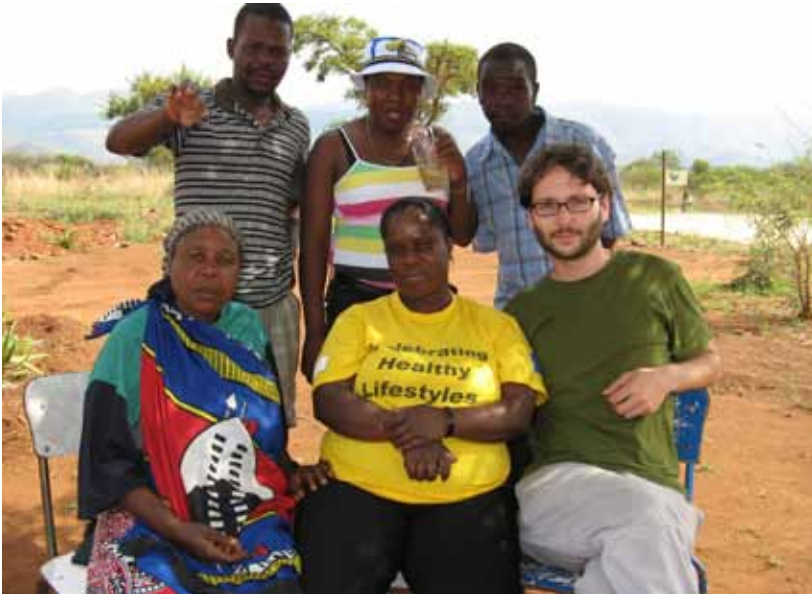
Photo 34: Being in the field, eMjindini Township, Barberton (2008)