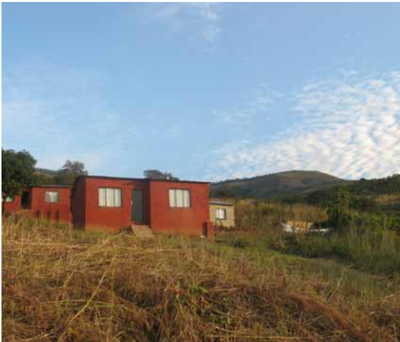
Photo 15: Government-subsidised housing in KaMadakwa, eMjindini Trust