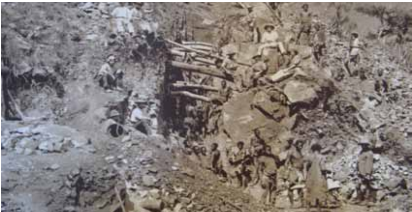
Photo 13: Late 1880s. Labourers working at a gold mine on the Komati River.