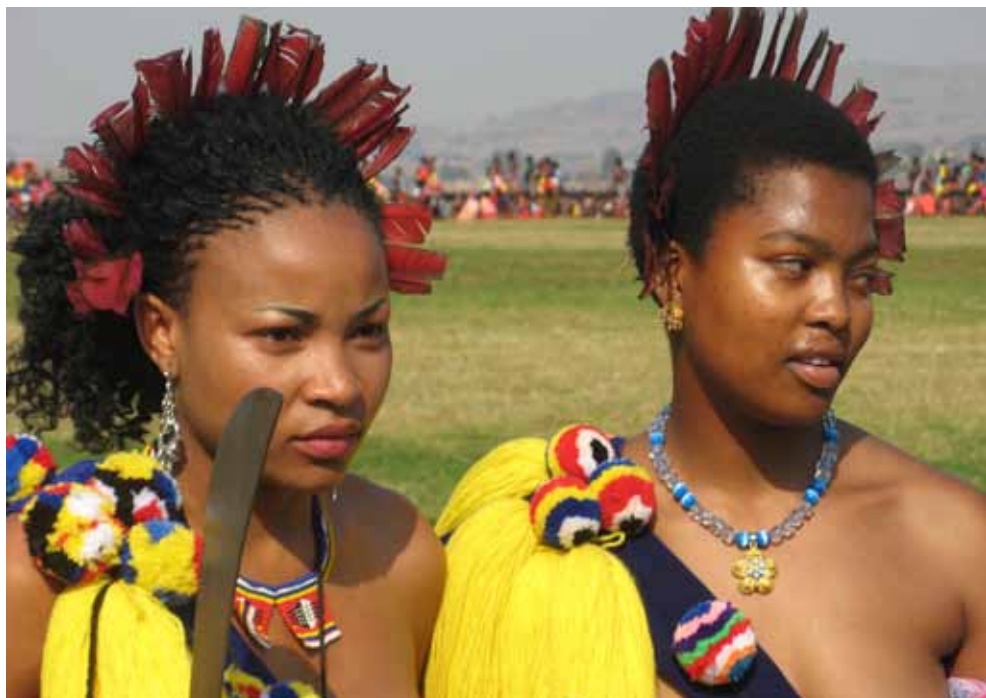
Photo 8: The red feathers of the ligwalagwala bird indicate their royalty