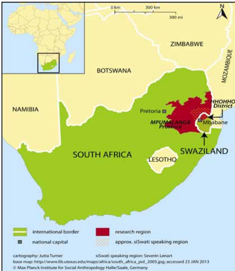
Map 1: South Africa (Mpumalanga Province) and Swaziland (Hhohho District)