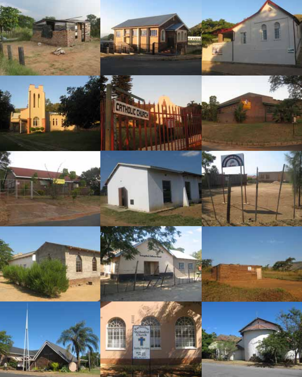
Photo 19: Churches in Barberton, eMjindini Township and eMjindini Trust (2009)