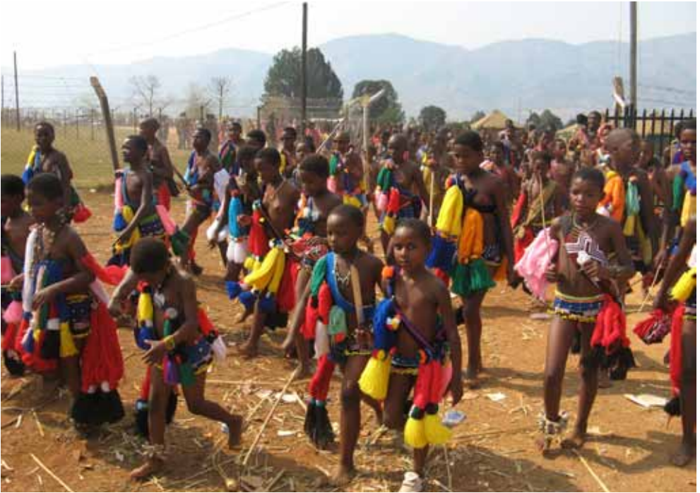
Photo 2: Festive entry of the timbali ('flowers', young maidens) (2009)