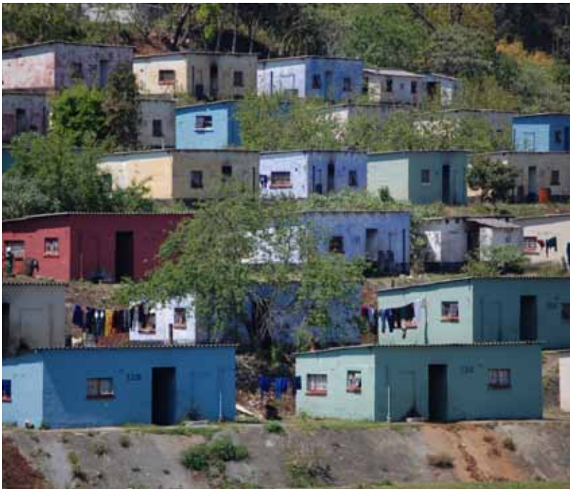
Photo 21: Bulembu is now privately owned by Bulembu Ministries Swaziland (2009)