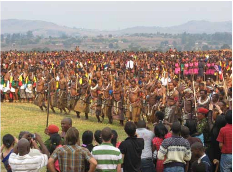
Photo 15: King Mswati III (11 th from left) with princes and other influential men