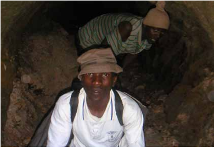
Photo 8: Former 'illegal' small-scale miners, the so-called tinvikunyane (moles) (2009)

to earn money and support their families, buy cars or build houses, or simply consume liquids and sexual services. However, once they are arrested and brought before the court some of the accused use the possibility of legal-aid, which means the trial needs to be postponed for further consultations. At the next trial some of them suddenly change their mind and do not want any further legal protection, or it is just the other way around. They have either realised that, if they are on bail, they can delay their presumable conviction by 'playing' the legal-aid card or they were 'briefed' by more experienced detainees how to defend themselves: "They know how to argue, believe me, even if they don't know the court proceedings they know how to try to fight for their innocence. Yes, and you'll get the ones obviously that have been in court many times; they might as well be an attorney." 12 This is to be seen in conjunction with a general sceptical attitude among adolescent and adult males towards the police ('they are corrupt') and the judicial system of which the free legal-aid attorneys are part of ('they are all playing the same game'). However, I will follow up on these issues by interviewing legal-aid attorneys I have recently met and conduct further observations in court.