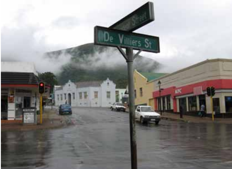
Photo 1: A rainy summer day in the Barberton central business district (2008)

as location, lokasie (Afrikaans), eLokshini or eKasi (siSwati), and the term eMjindini usually denotes the chieftaincy. For the sake of readability and to avoid confusion, I shall speak of the ‘township’ when referring to eMjindini Township, and of ‘eMjindini Trust’ when specifically referring to the trust area. Further, I decided to use the name ‘eMjindini’ for the (imagined) chieftaincy, which comprises eMjindini Trust, the township but also surrounding land as well as the town and suburbs of Barberton ( Babtini in siSwati). When I talk about the area in more general terms without particular reference to the chieftaincy, I shall speak of eMjindini/Barberton.