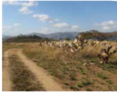
(2007) Photo 7: Remnants of the cactus cultivation (2009)