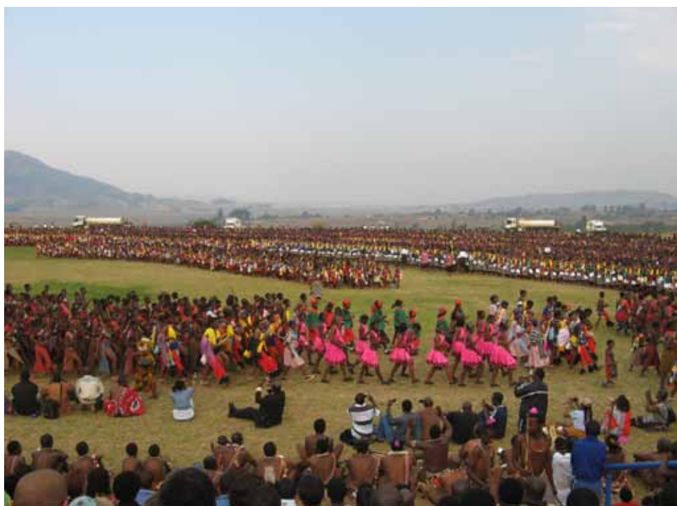
Photo 9: A visiting dance group from Namibia in pink-coloured dresses