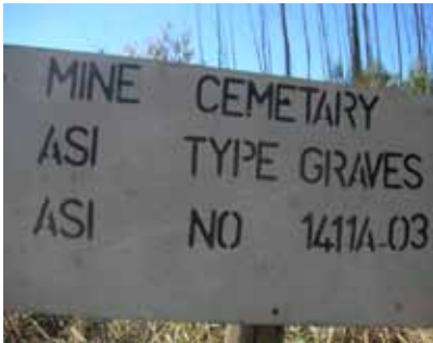
Photo 14: The abandoned Piggs Peak gold mine cemetery