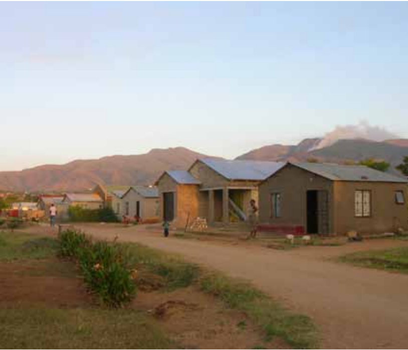
Photo 6: Government-subsidized houses in eMjindini Township, Barberton (2007)