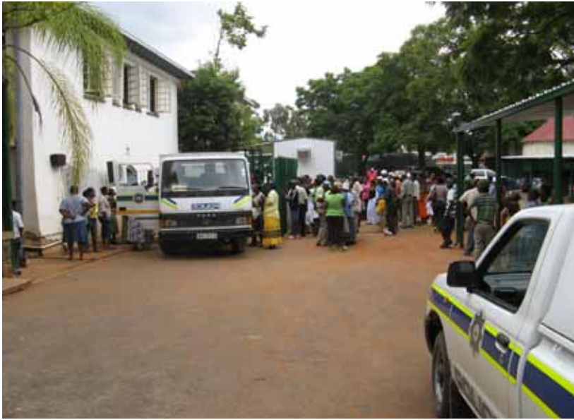
Photo 6: Relatives of 'illegal' miners at the Barberton magistrate's court (2009)

Since September 2008 91 'illegal' miners had been convicted in the criminal court by the well-collaborating and specialised team of a senior prosecutor and a magistrate. 69 of the convicted had received a two-year prison sentence (three years with one year suspension), currently the maximum punishment in this regard. All of them guilty because of trespassing and hence contravening the Mine Health and Safety Act . 8 However, I will give some brief examples of court proceedings relating to 'illegal' mining in the Barberton criminal court to develop some further questions which could be potentially examined.