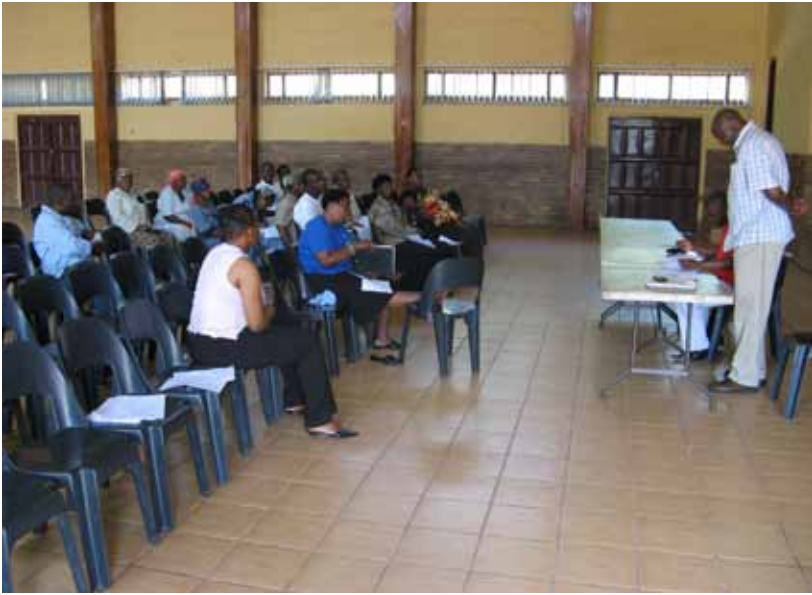
Photo 15: A re-start meeting in the eMjindini town hall, Barberton (2008)