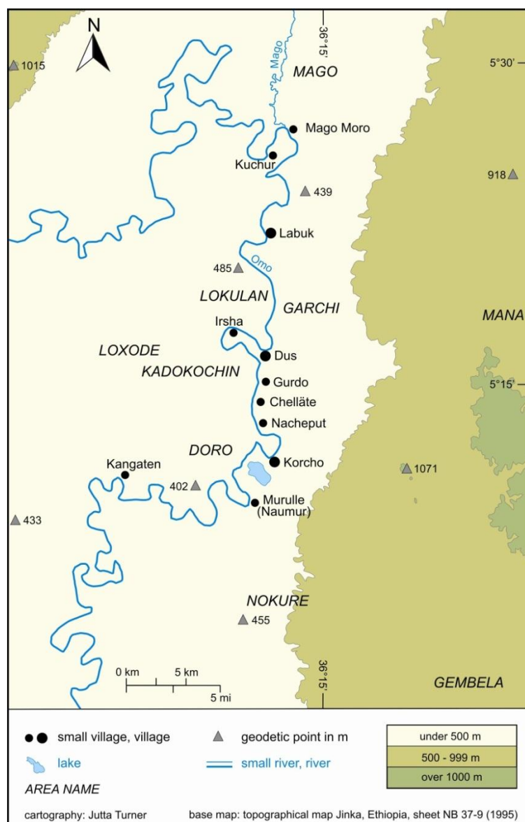
Map 1: Settlements of the Kara on the Eastern Bank of the Omo River (as of 2007)

Nyangatom and Mursi. Taken together, these examples indicate that the Kara held a central position among their neighbours in the early to mid-twentieth century.