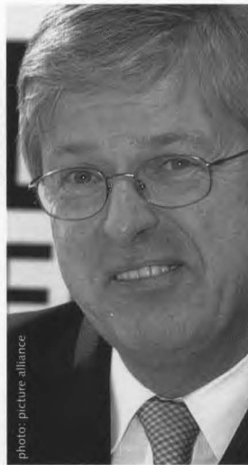
HUBERTUS SCHMOLDT , President of IG BCE, the mining, chemicals and energy union:

In any case any form of employee representation at board level can only be evaluated within the context of industrial relations in society as a whole. It is noticeable that where there is board-level representation, there are frequently also various forms of involvement in plant-level decision making and rights which result from