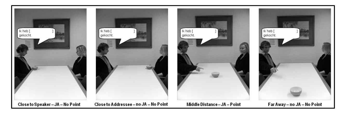
Figure 1: Subset of target pictures used in the elicitation task (converted to grayscale). Below the pictures it is indicated to which condition the picture belonged. The object could be in four different locations. There could be joint attention (JA) or no joint attention (no JA) between speaker and addressee to the object, and the speaker could either make a pointing gesture towards the object or not.

and a concluding picture. Figure 1 shows a subset of the picture materials.