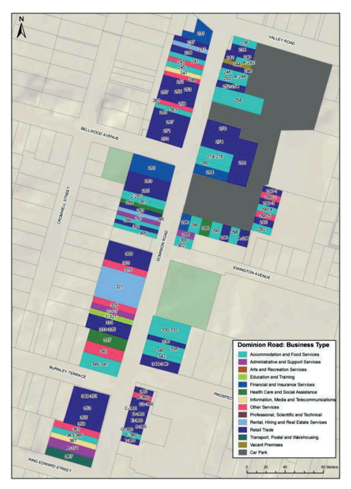
Map 1: Classification of business types along Dominion Rd