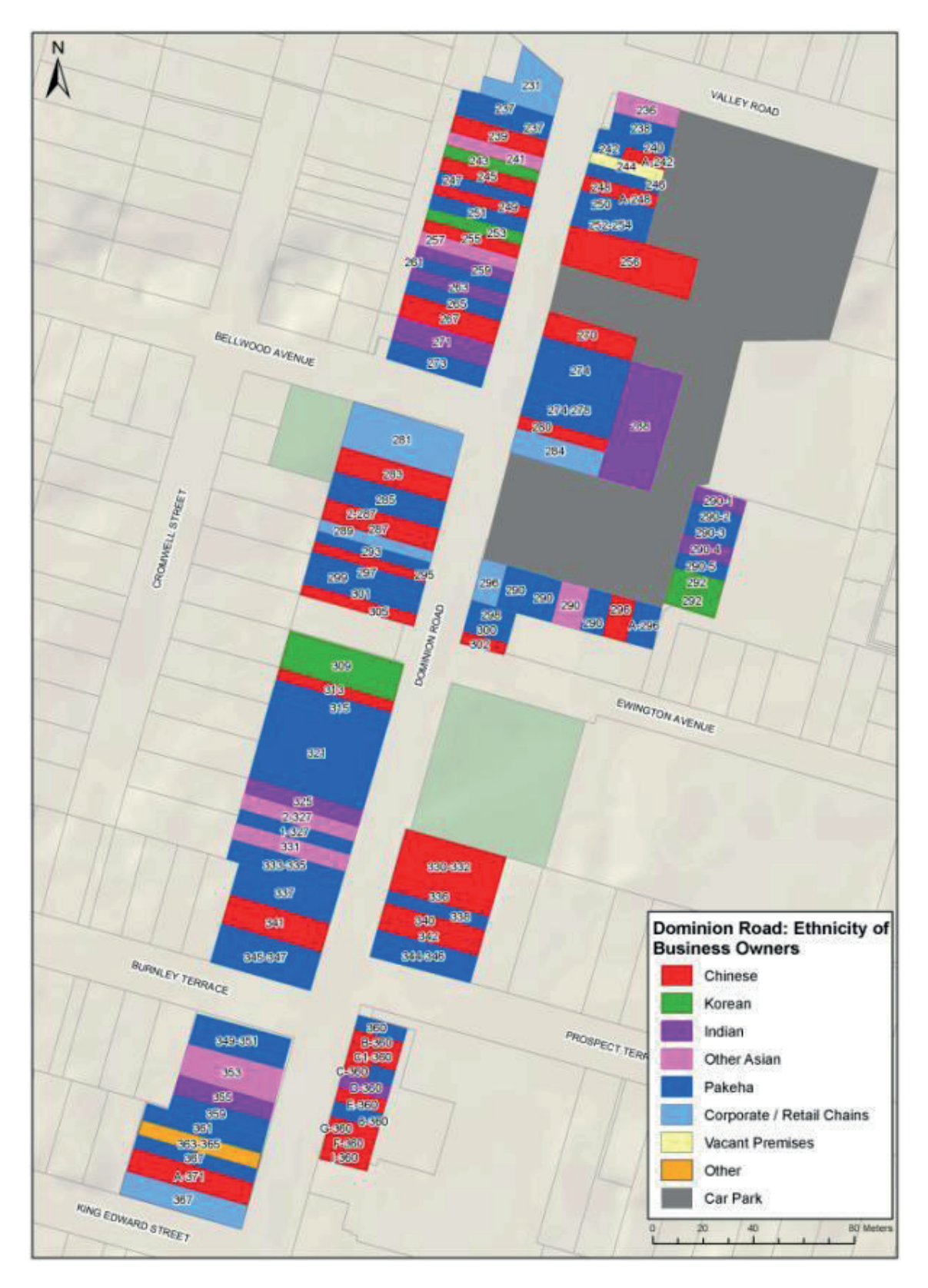
Map 2: Classification of businesses by ethnicity of owners/operators along Dominion Rd