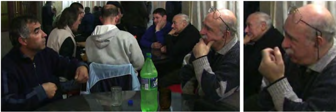
Figure 2: Stills of line 1 (L) and line 2 (R). In line 2, B initiates repair by offering a candidate understanding: ‘{of} cars?’. His raised eyebrows indicate a polar question.

Finally, there is the alternative question format type, in which the person initiating repair offers multiple candidate solutions to be accepted or rejected (Koshik 2005). This is an infrequent type, as with alternative questions generally, that appears to be a grammatical possibility in all of the languages. It is akin to the restricted offer type in offering a possible solution, rather than requesting one. Here is an example from Italian (Rossi, this issue). Speaker A mentions “ten pictures”, upon which speaker B asks: “his or someone else’s?”, presenting the prior speaker with two possible understandings. In response, Speaker A disconfirms the first of these options and affirms the second by repetition.