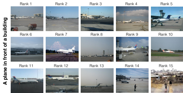
Figure 2. Top ranked retrieved images from the query 'An airplane in front of a building' (SUN09 image dataset and our set of human queries). We see a high recall achieved by our method and two clear mistakes - Rank 7 and Rank 15.