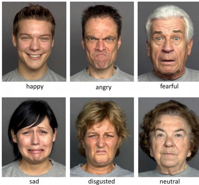
Figure 1. Sample facial expressions of posers from the three age groups. [To view this figure in colour, please visit the online version of this Journal].

six separate models with participants' ratings of the six expression dimensions as dependent variables. Predictors included the target expression (dummy coded with 1 indicating that the dependent variable corresponded to the target expression), the poser's age (dummy coded with young adults as reference group), and their interactions. The intercept was allowed to vary between posers and raters, and the slopes of the dummy variables for target expression and poser age group were allowed to vary between raters. All random effects were assumed to follow a