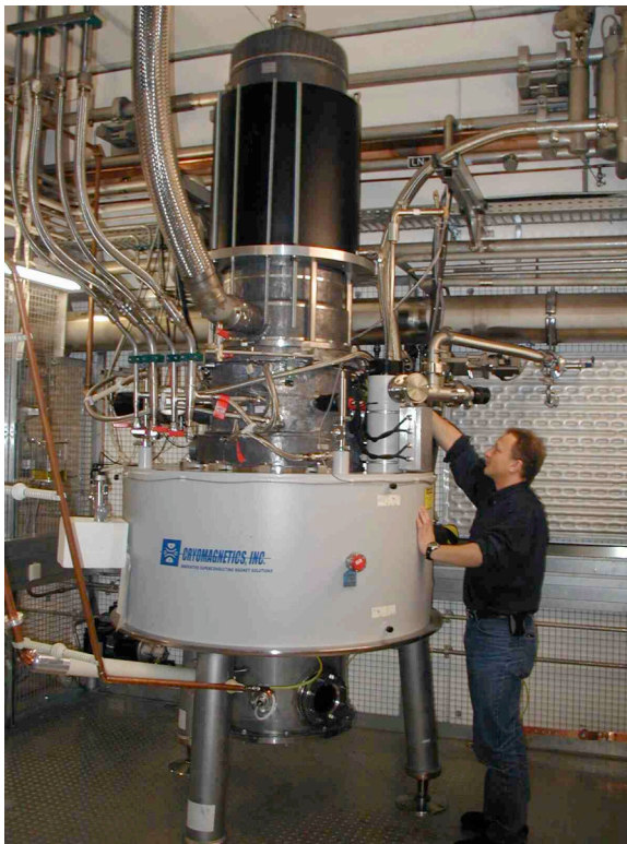
FIGURE 1. The TED SNo.1-Gyrotron under test.

The development of the W7-X Gyrotrons started in 1998 in Europe with Thales Electron Devices (TED) and in USA with CPI as industrial partner. Results from the two R&D tubes from TED are reported in [6]. The year 2005 saw the successful full performance tests of Gyrotrons from both manufacturers, CPI and TED: The final tests of the CPI gyrotron and the 1 st series Gyrotron from TED (see Fig.1) were completed in May and September 2005, respectively, at IPP.