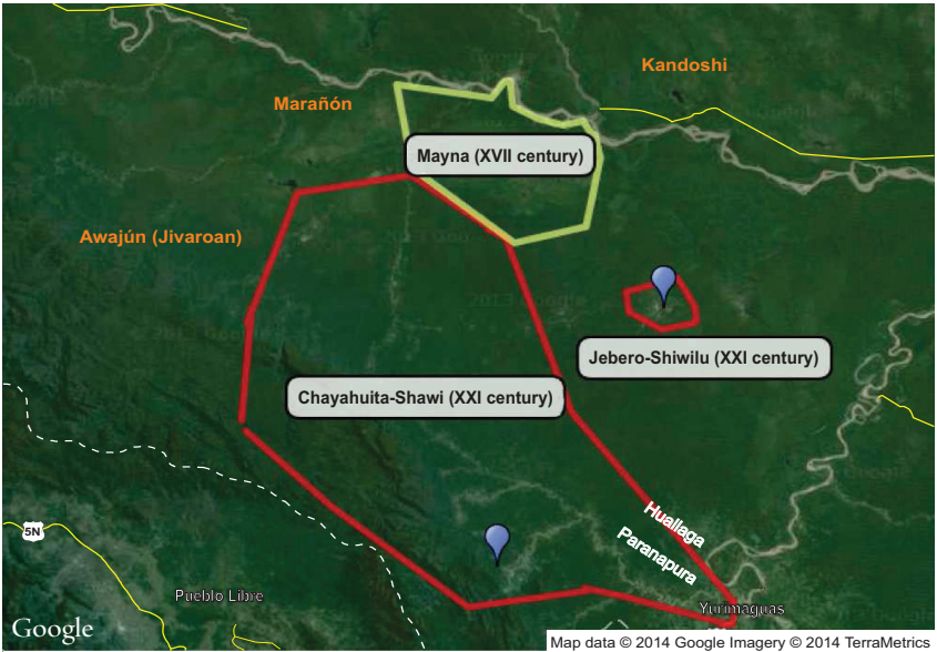
© 2014 Google Imagery © 2014 Terrametrics © Scribbe Maps 📎

If the data provided by all the previous accounts is accurate, this southern Mayna language, by no means a Candoan language, but a Kawapanan language, may be a today completely extinct Kawapanan language or the ancestor of the modern northern varieties of Shawi, like Cahuapanas and Sillay, still spoken nowadays, or Shawi in general. Since no thorough descriptions of this northern dialect have been yet made, it is impossible to state an undoubtful affiliation. Based on the data provided in the previous paragraphs and my own data collected in previous fieldwork, I am as yet assuming they were different but contiguous and maybe conformed a linguistic continuum. Hereby, I present a map with the approximate location of the Southern Mayna language, member of the Kawapanan language family, spoken in the XVII century AC: