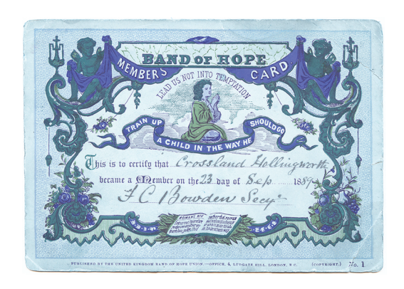
Figure 4. Band of Hope Pledge Card, 1889. 'Train up a child in the way he should go'.

All are agreed that one cannot accomplish in one scientific lecture what can be achieved by systematic teaching in a Band of Hope, in which instruction is given by devoted Christian men and men who are able to deal with the moral and spiritual sides of the question and to direct their personality upon winning the friendship and confidence of their charges. A lasting loyalty is engendered in the heart of the child, and this is strengthened by the signing of the pledge.22