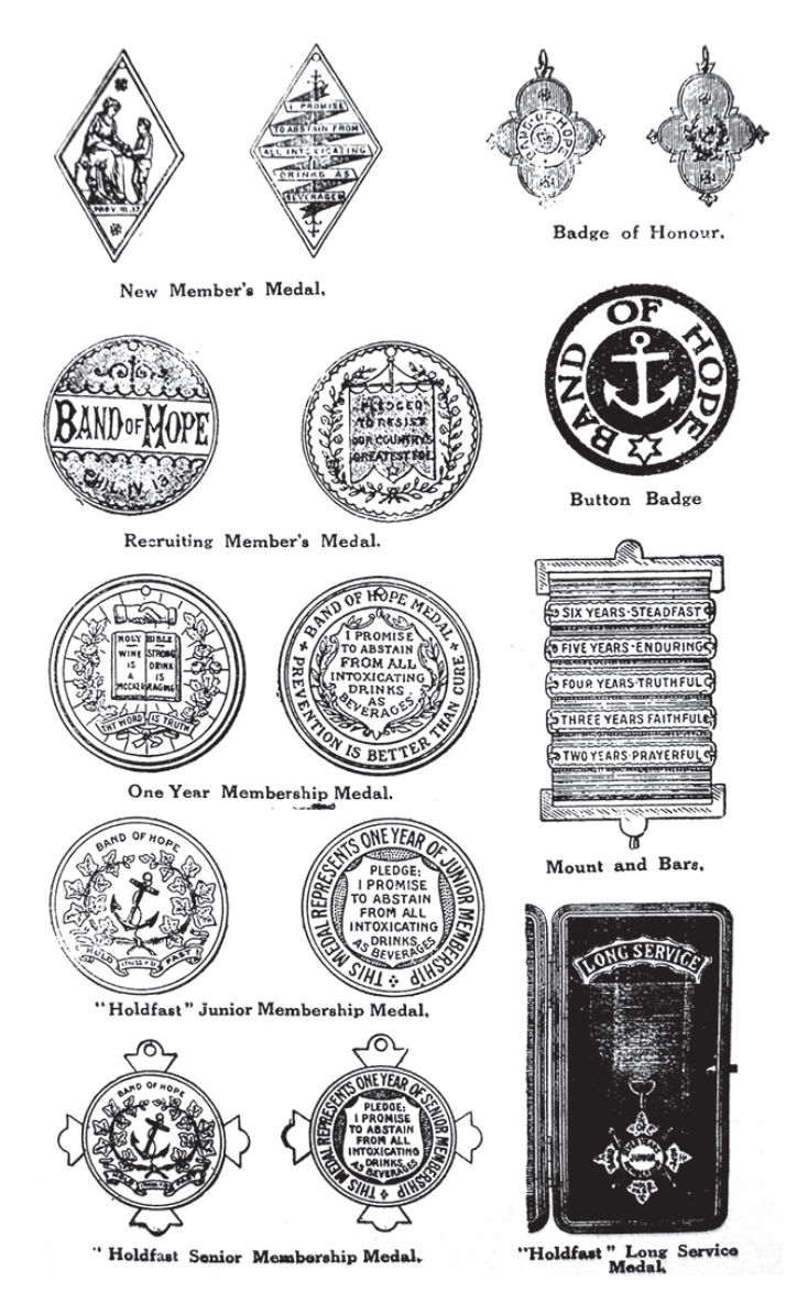
Figure 3. Advertisement for UK Band of Hope Union Medals and Badges, at the back of The Band of Hope Manual (London: UK Band of Hope Union, 1894).

The badges rewarded faithful members, and bars and long service medals marked a young member's years of commitment to the movement (Figure 3). The pledge cards were personalized and often beautifully decorated to adorn the wall of a child's house (Figure 4).