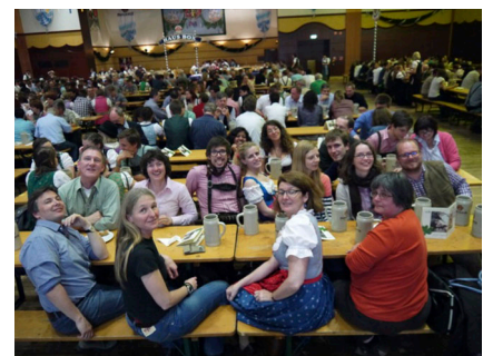
The Schwille lab (some in traditional Bavarian dress) at Starkbierfest, Munich's spring counterpart to Oktoberfest.

Downloaded from http://rupress.org/jcb/article-pdf/209/3/320/1368432/jcb_2093949.pdf by Max Planck Institute of Biochemistry user on 25 March 2021