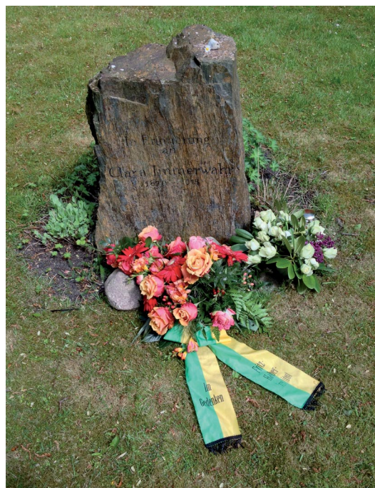
Figure 10. Memorial for Clara Haber in the garden of the Fritz Haber Institute of the Max Planck Society, installed in 2006. The photo shows the memorial at the centenary of Clara’s suicide, on May 2, 2015.

Our intention has been to make the above points without belittling in the least Clara’s achievements and courage. Honoring Clara, for instance through the Clara Immerwahr Award of the Nobel-Prize winning organization International Physicians for the Prevention of Nuclear War (IPPNW) or the Clara Immerwahr Award of the Berlin Excellence Cluster UniCat, is highly to the point and should not be questioned in any way. Haber’s institute, named after its founding director in 1952 and incorporated into the Max Planck Society in 1953, had a memorial built for Clara in the garden of the institute in 2006 (Figure 10).