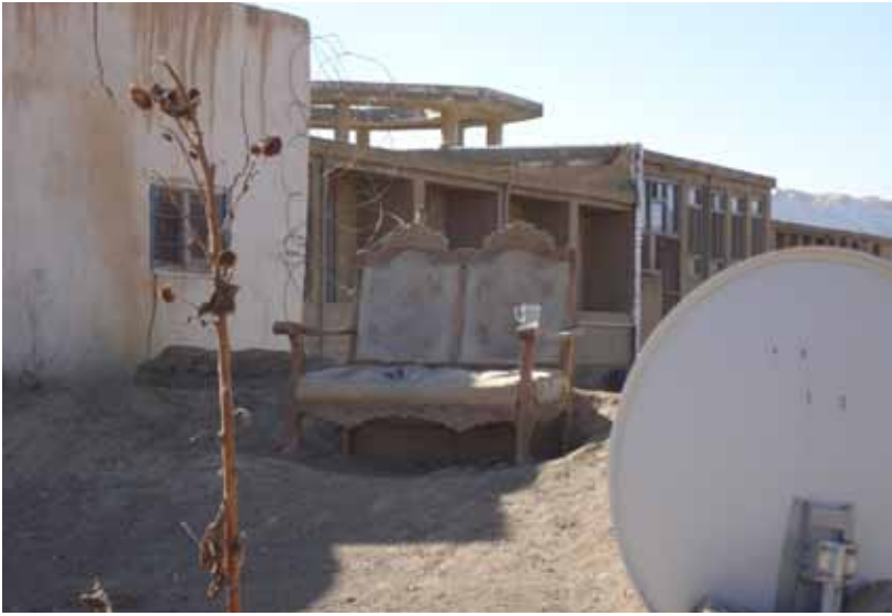
Waiting for what there is to come