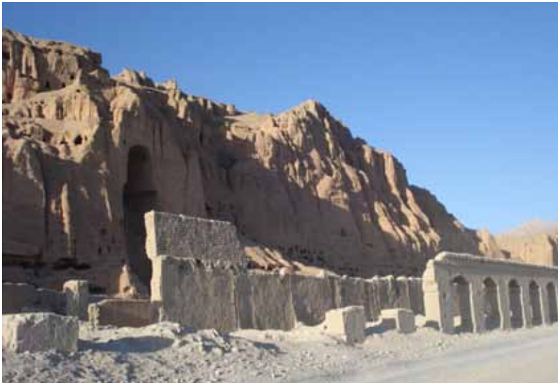
Remnants of an ancient Buddha statue and the late bazaar - both destroyed in the recent wars (F. STAHLMANN, 2009)

This research project analyses the realization of procedures of disputing under the special circumstances of so-called 'post-war' times. Violent regime changes, wars, and especially civil wars are not only prone to causing immense suffering and injustice, but also to undermining the means and institutions through which injustice could be addressed and remedied. The data gathered about disputing processes in Bamyan, Afghanistan in 2009 confirm such persuasive injustice and a continuing rule of might rather than of law. However, the reasons usually suggested could not adequately explain these dynamics. Not only was Bamyan an extra-ordinarily peaceful place in 2009; the formal conditions for a successful establishment of an order of justice were also fulfilled to a surprisingly high degree. By tracing and analysing the considerations by victims of trespass, this research shows that one main reason for this continuing injustice lies in the experiences people have had during the civil