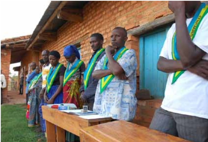
Mediators praying before hearing claims, Southern Province, Rwanda

The thesis shows how the global travelling model of mediation as an informal and alternative form of dispute resolution is translated into a post-conflict context as a mandatory organizational extension of the justice system which relies upon voluntary mediators – mandatory voluntarism, which can be generalized for other contemporary forms of Rwandan legislation and policy-making. Mediation in the Rwandan context is not necessarily an alternative mechanism of dispute resolution, but a legal fix responding to the need to make the justice system accessible in order to settle disputes of claimants in precarious conditions. At the same time, legal aid and mediation – because of their situational flexibility and openness to negotiation as such – hold a certain promise with regard to the Transformation of social relations of disputants (Bush and Folger 2005) and in their orientation towards the future