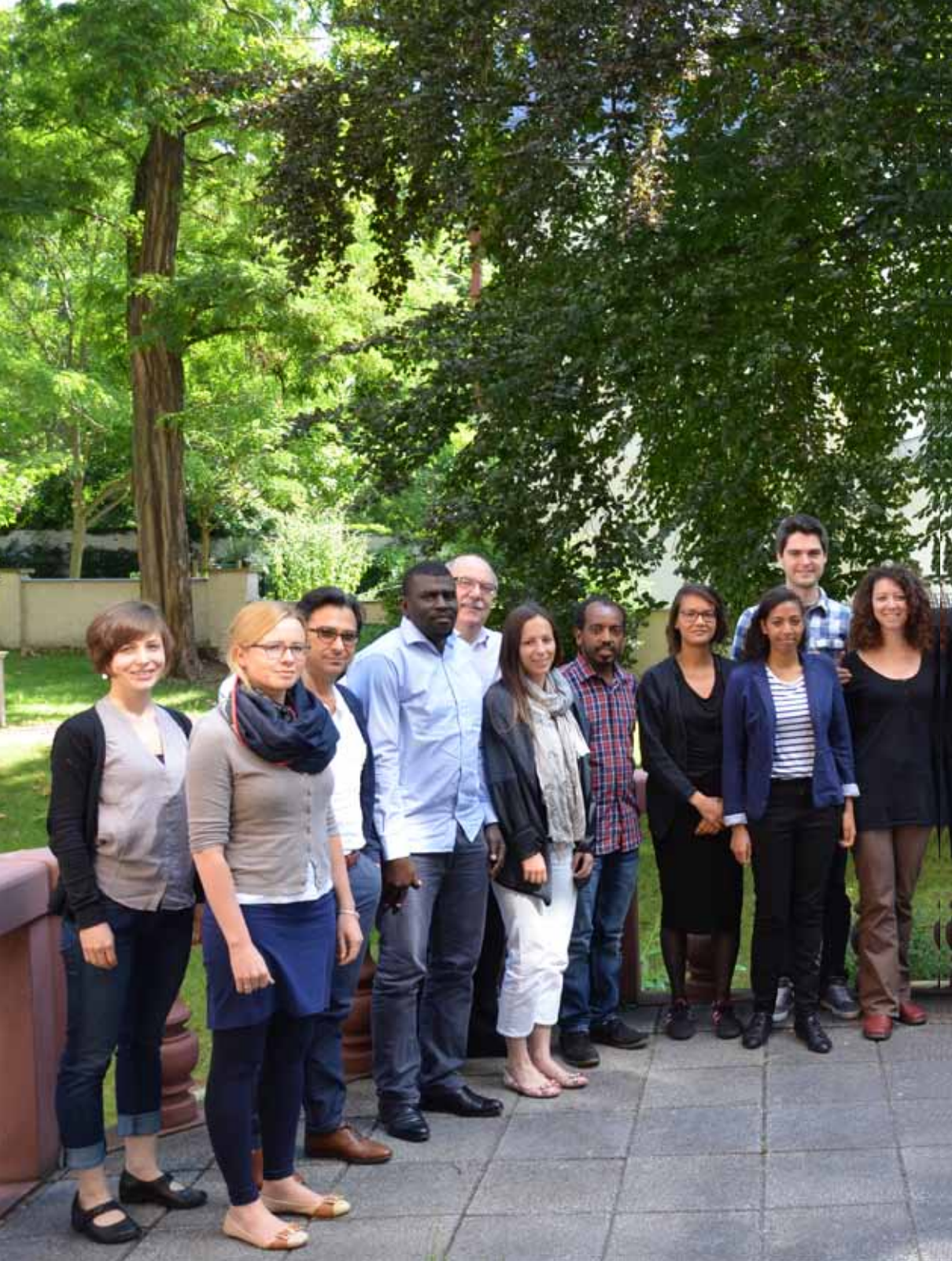
REMEP Group photo at the Summer University 2014