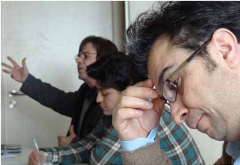
REMEP Winter University 2012