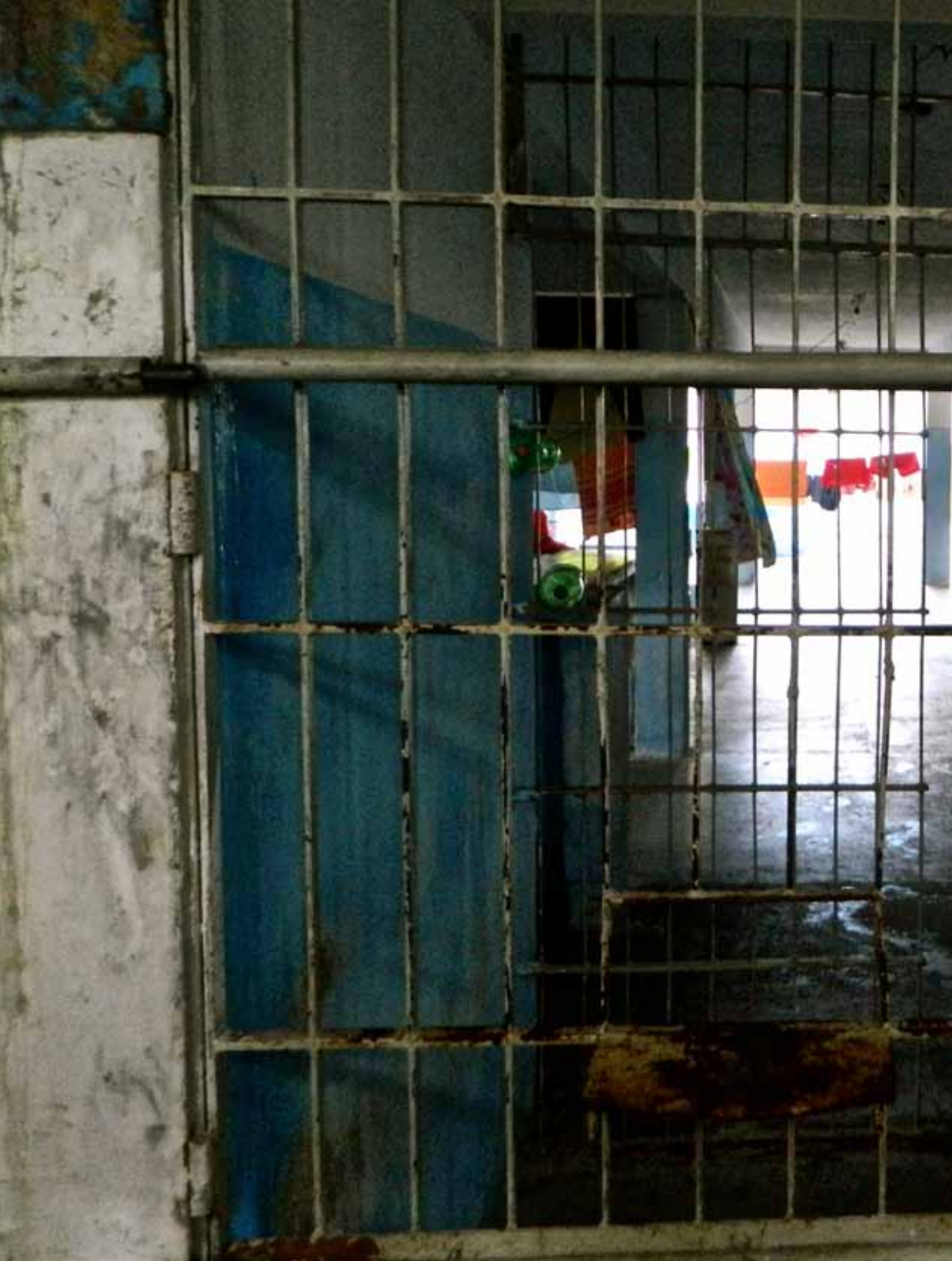
Prison in Maceió, Brazil