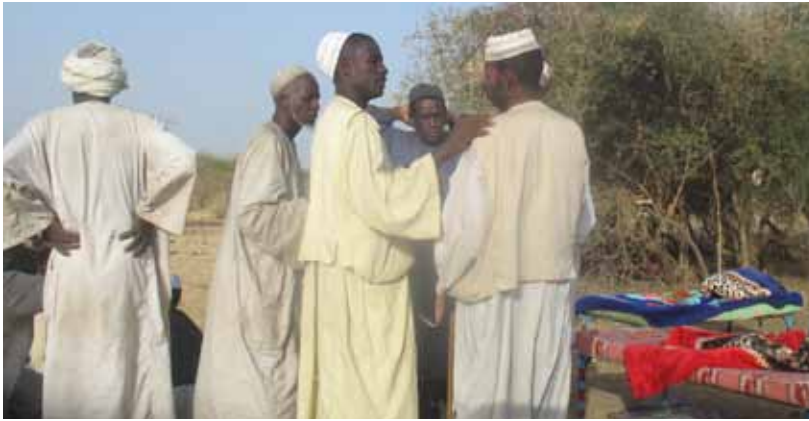
Herders from Uuda Fulbe and Lahawiyyin Arabs, South Gedaref State, Sudan (Z. ABDAL-KAREEM, 2012)

ing the second issue, processes of ethnic identification, this study adopts the notion that focusing only on the issue of natural resources – land in this study – is not sufficient for an adequate analysis of the conflict phenomenon.