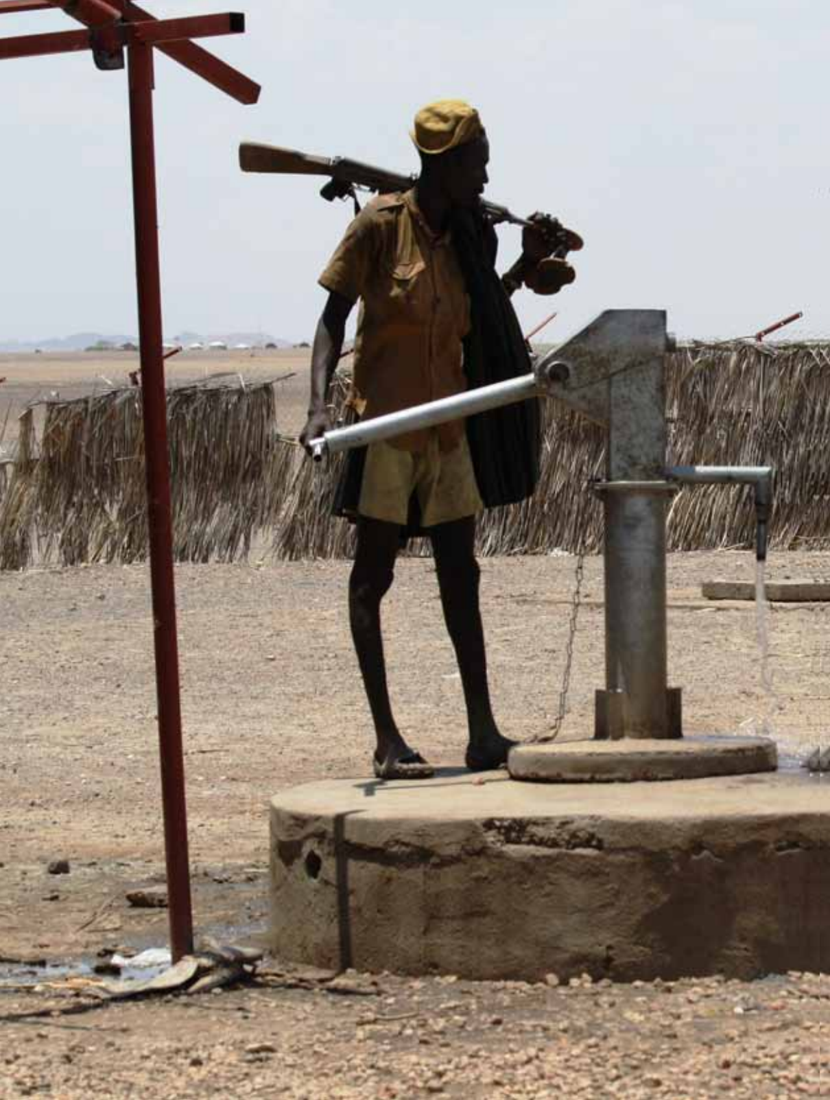
Turkana raiders fetching water