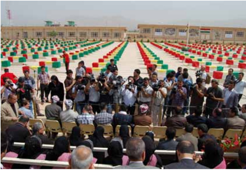
Ceremony of returned mortal bodies