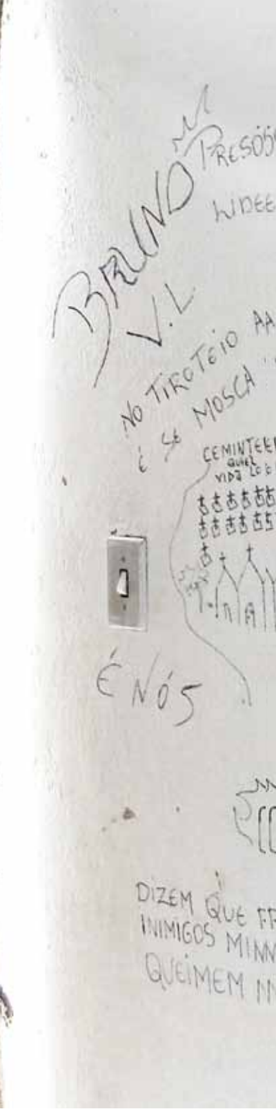
Drawing of an 18-year-old boy accused of involvement in more than 70 homicides, internment unit for adolescents in Maceió, Brazil (C. MOURA DE SOUZA, 2013)