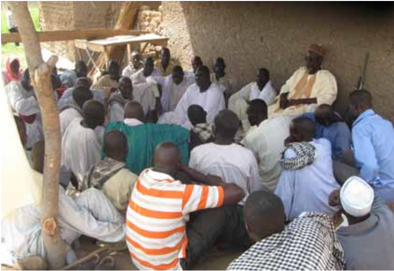
Customary court of a canton chief, Northern Cameroon