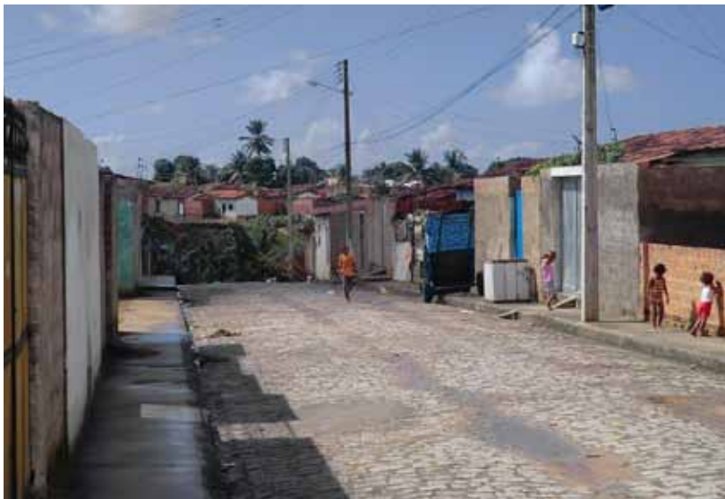
Cidade Sorriso, a poor neighbourhood in Maceió