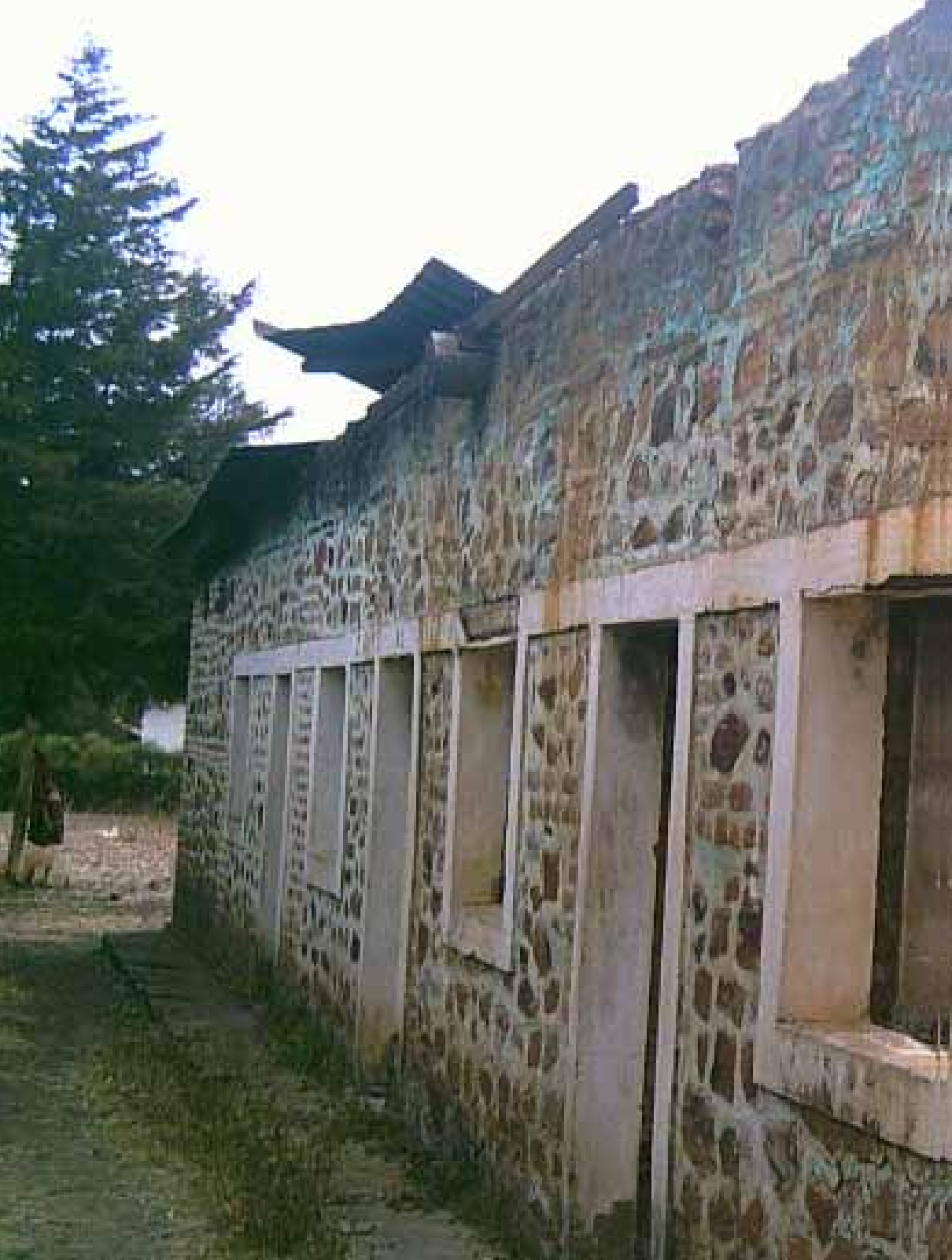
A former court building in Burundi that was destroyed during a rebel attack (D. KOHLHAGEN, 2008)