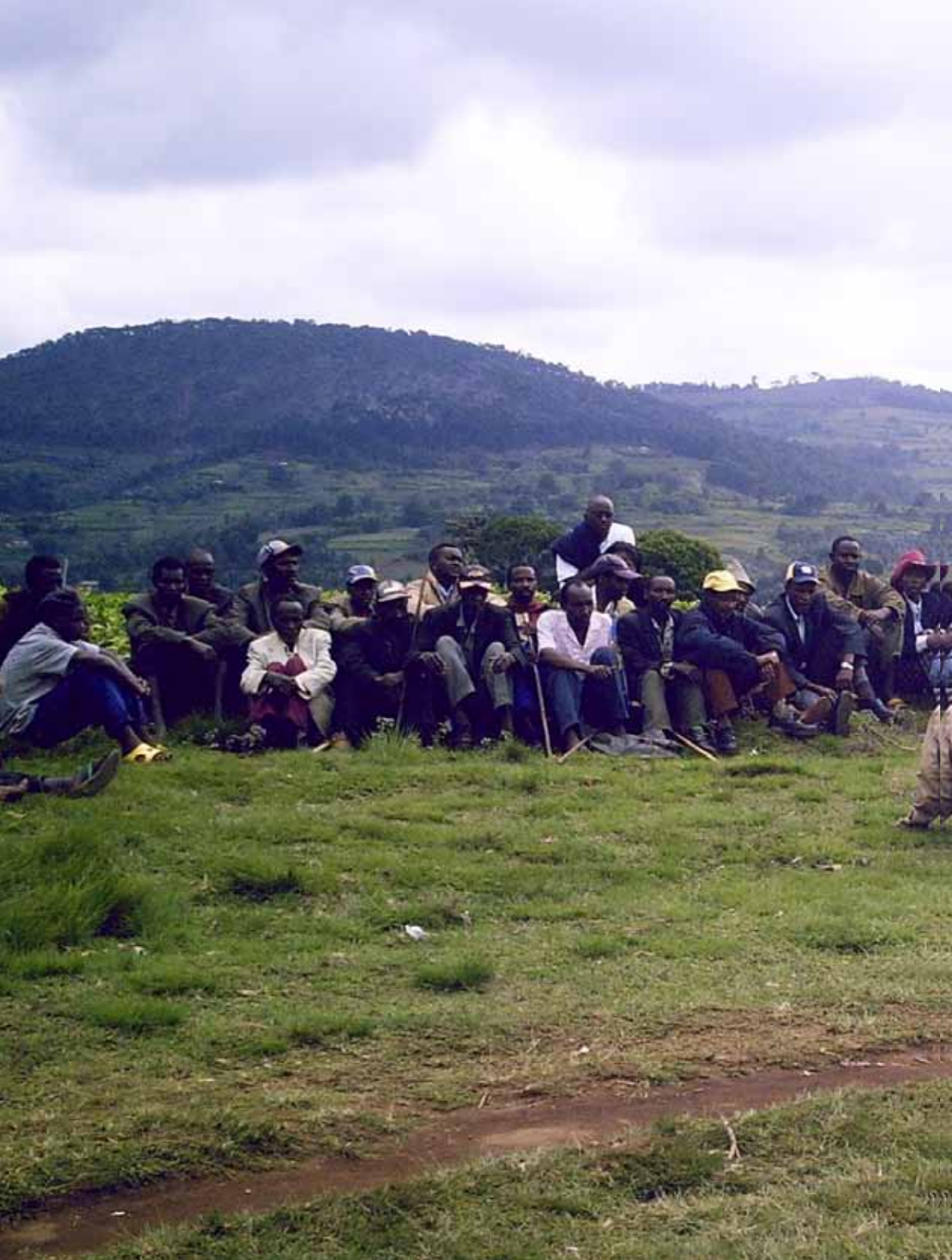
Bashingantahe Council in Burundi settling a dispute