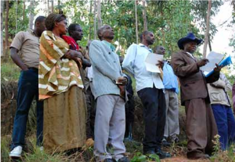
Mediators and disputing parties during a field visit, Southern Province, Rwanda

The thesis shows how (re-)creations of trust and integrity, compassion, hope, and social cohesion are inscribed in legal institutional designs in order to provide for spaces of participation through the evocation of legal justice. '[L]egal instruments appear, [...] to offer a means of commensuration: a rep-