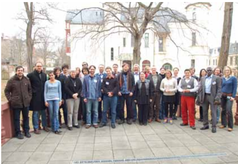
REMEP Group Photo