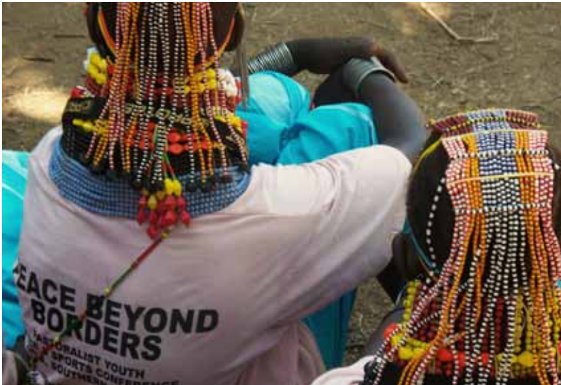
Ateker peace meeting, South Sudan

Attempts of national governments, international and local NGOs to gain control over or contain the inter-ethnic violence of pastoralist populations, as well as efforts to ‘modernize’ them and ‘eradicate’ their perceived poverty, have so far produced rather ambiguous results. My research explores the roots of these continuous failures. The involved nation states’ problems with corruption, rights abuses and political violence are well known and the involvement of ‘modern’ structures and actors in the violence has increasingly been highlighted. Yet to avoid shallow and stereotypic explanations, this project draws on research across disciplines to explore how exactly structure and