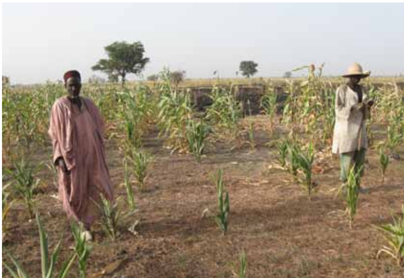
Farmer and herder on a field, Northern Cameroon

The objective of this PhD research is to support the claim that common resources are not the same as open access resources and that though conflicts form an integral part of common resource use, they are not necessarily a tragedy. To do this, the thesis will present extended case studies in three areas in the Far North Region of Cameroon in different seasons. These areas have different socio-political histories and ecological conditions but their bush land is commonly shared and accessible for seasonal users, like transhumant herders and fishermen or migrant farmers.