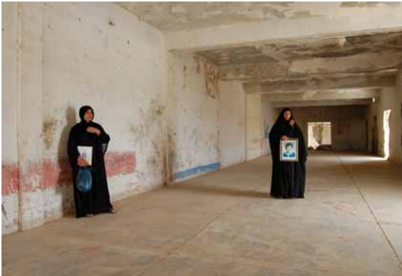
Survivors revisit death camp, Topzāwā

The research project examines the repetition and translation of memory of the al-Anfâl and its inexorable bond with justice in the post-Ba'ath Kurdistan. As the first interdisciplinary study it explores the ways in which survivors and relatives of the victims, the Kurdistan regional government, and civil and political activists are engaged in the processes of repetition and translation that alters memory as well as entwines it with justice, including reparations in proportion to the harm endured during and in the aftermath of the al-Anfâl. It discusses how audio/visual representations, mournful music and songs, theatrical staging, and verbal repetition (i. e. annual remembrance days) multiply, make visible, and communicate the memory of the al-Anfâl.