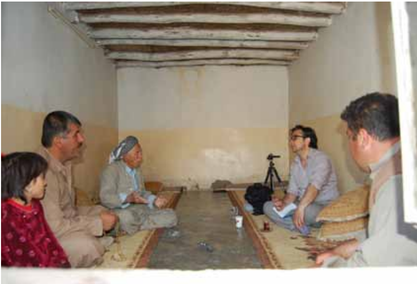
Interview with Al-Anfâl survivors

The study challenges the historiography of the al-Anfâl, which is often only defined as 'conventional military operations and chemical attacks carried out between 23 rd February until 6 th September 1988'. The al-Anfâl is also interpreted as responsible for killing an estimated 182,000, women, children, and men, the destruction of 4,500 villages, as well as the displacement and the resettlement of 1.5 million Kurds from rural areas. In its verdict of the al-Anfâl trials, released in 2007, the Iraqi High Tribunal in Baghdad recognizes the al-Anfâl as acts of genocide, war crimes, and crimes against humanity.