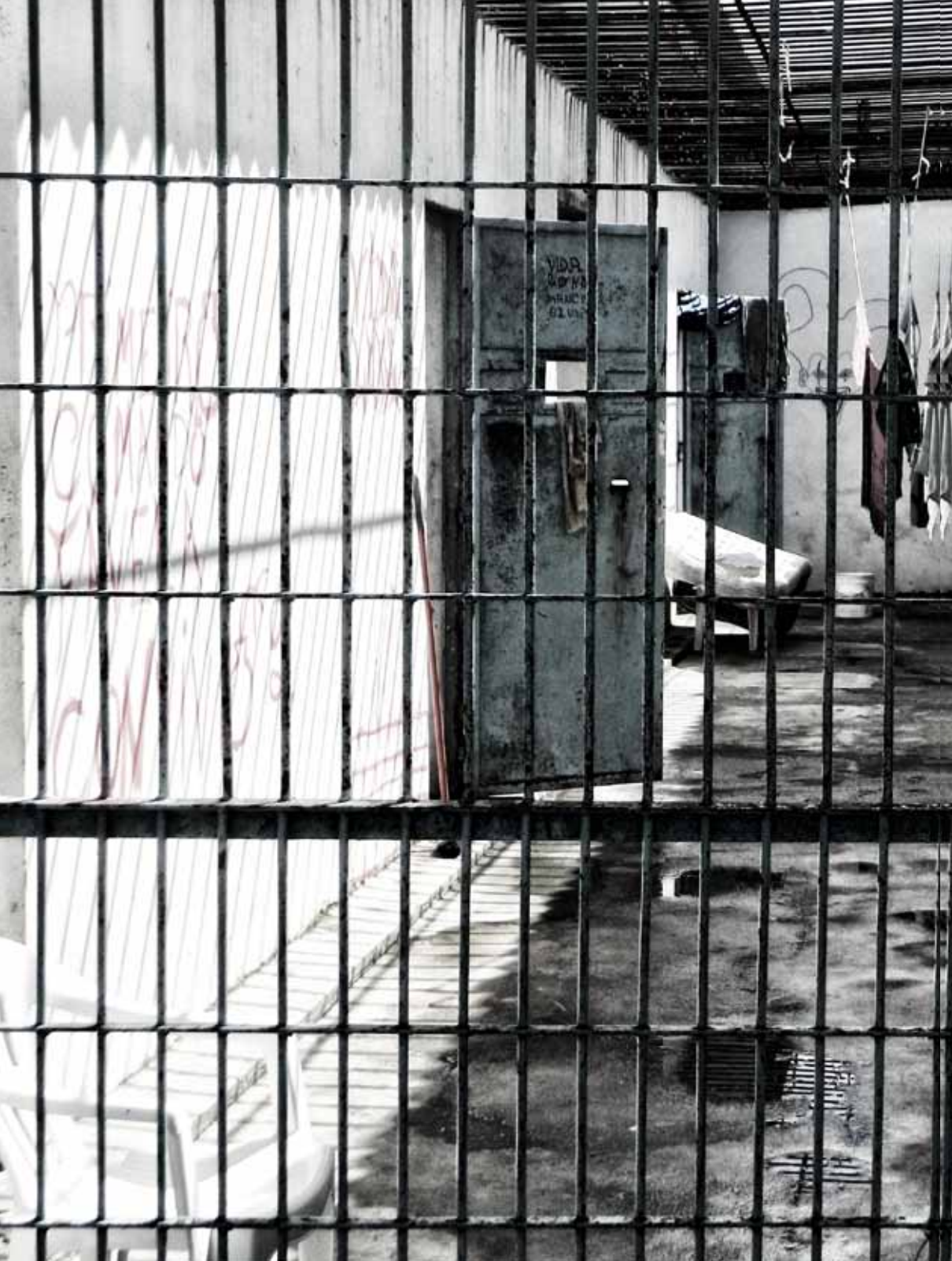
Prison in Maceió, Brazil