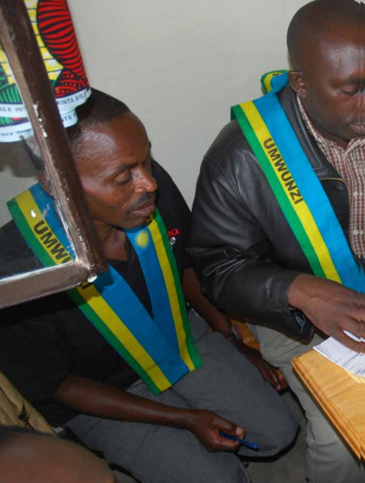
Signing an agreement after mediation, Southern Province, Rwanda (S. BOGNITZ, 2013)