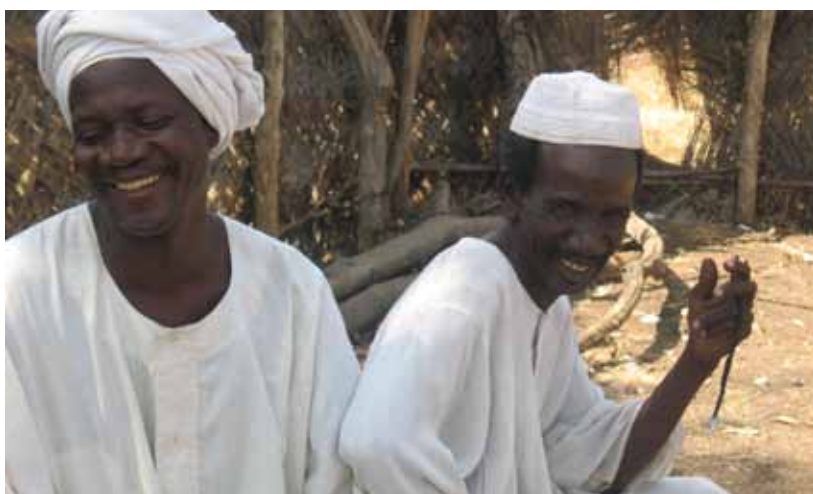
Local chief chatting with one of his friends in his house, South Gedaref State, Sudan

Other important aspects that are connected to the roles played by commercialization together with the expansion of both livestock and farming activities, including the introduction of mechanized farming projects, in Sudan will be addressed. Here, the questions of to what extent/ and how have farmers and pastoralists been integrated into the international world economy and what are the implications at the grass-root level will be considered. Concern-