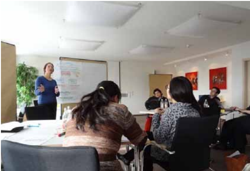
Soft skills course during the Winter University 2012

During the academic year, the curriculum is complemented by soft skills seminars, e.g., on project management & trouble shooting, rhetoric and presentation skills, and academic writing. Each seminar is conducted by a pro-