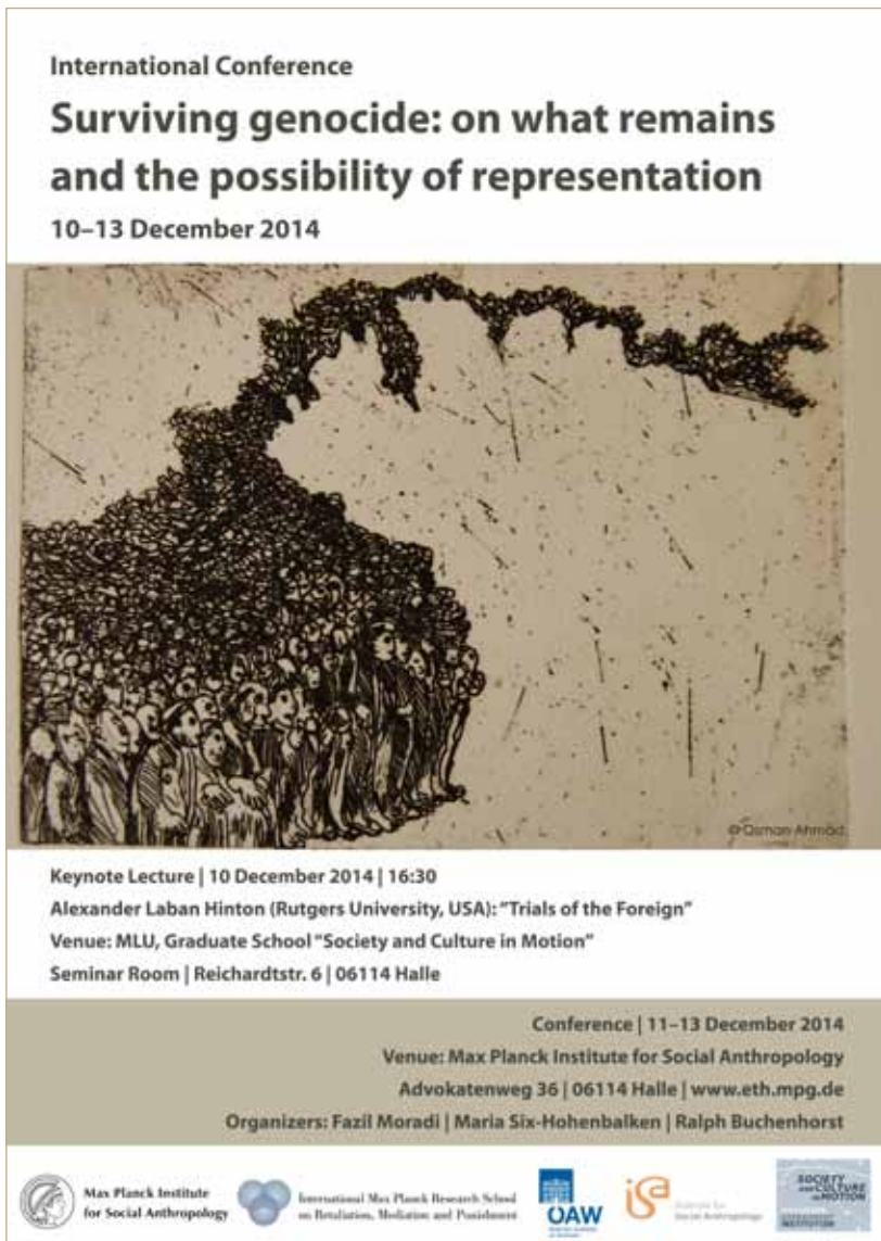
Conference Poster 'Surviving Genocide'