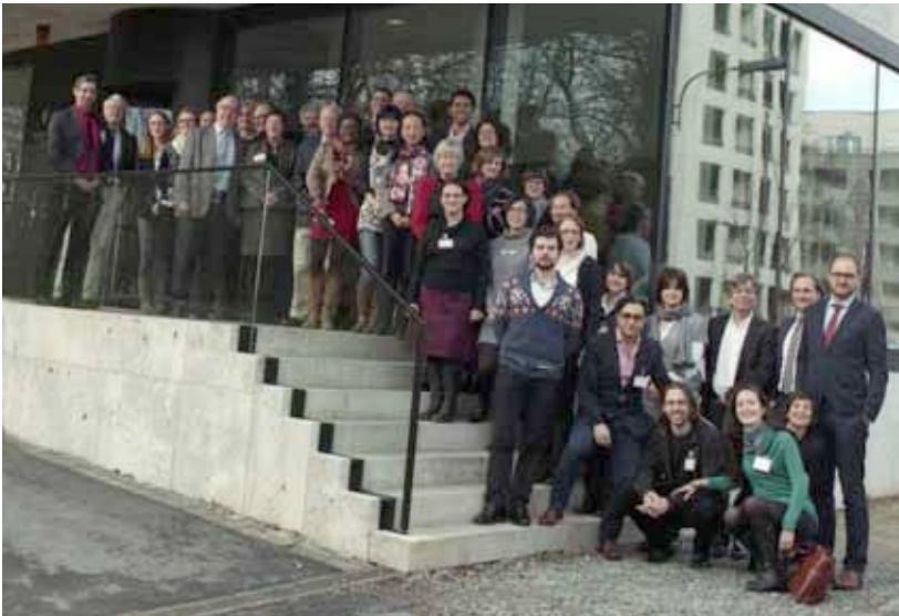
Group photo at the conference ‘On Mediation’

The conference presenters discussed a variety of conflict scenarios related to social and economic conflicts, cultural diversity and diverging normative orders, violence, crime, and international conflicts. The use of mediation