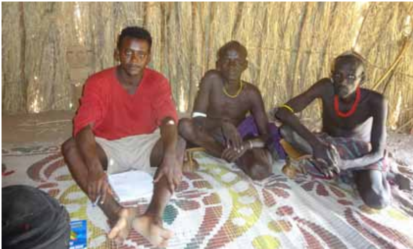
Fieldwork in Daasanach, Ethiopia

This project investigates the changing nature of conflict and the mechanisms in which it has been handled in the pastoral areas of southwest Ethiopia. Taking into account a growing prominence of the Ethiopian state in shaping interethnic relations in the context of both conflict and peace, this project particularly focuses on examining how social order and stability in the region have largely been shaped by extrinsic interests and identities rather than intrinsic realities. The preliminary data suggest that in recent years the state-building and consolidation processes and the emerging development narratives in the Lower Omo Valley have introduced diverse lines of conflict among different actors over matters that cover various dimensions of humanity. In addition, conflict itself and the different strategies of reducing it are redefined in a way that they fit into the interests of the new actors and the po-