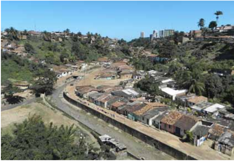
Grotta Vale Do Reginaldo, a shantytown in Maceió

cities. Maceió is the first Brazilian city in this ranking and confirms the results of the latest studies of Mapa da Violência , in which the city is marked as the most violent place for youths (between 15 and 24 years) and adults (over 25 years) since 2008. To explain this phenomenon in Maceió, the study Map of Violence 2008 suggests that some cities are experiencing rapid industrial growth, which in turn attracts an influx of workers, including a substantial amount of young people. As the number of would-be workers arriving in the cities often exceeds the available work opportunities, a vast number of unemployed youths without qualification are not able to enter the formal labour market. Without a perspective to find work in the formal market, youths are attracted to informal or illegal activities, such as selling drugs, producing and selling illegal copies of CDs and DVDs, physical tasks in which they have to work as bricklayers' assistant, or transporting things into the markets and on the streets of the city.