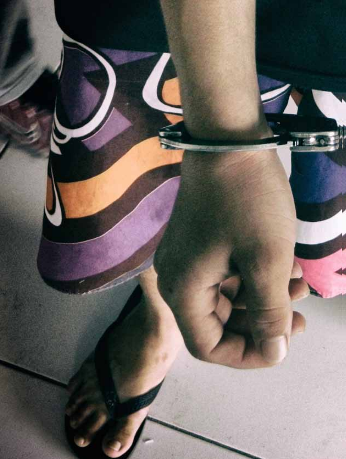
'Algemas' (handcuffs), photo taken in an internment unit for adolescents in Maceió, Brazil