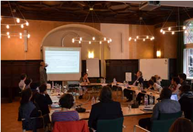
REMEP Summer University 2014