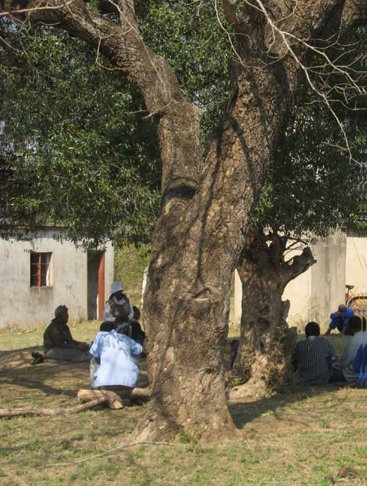
Justice under the tree