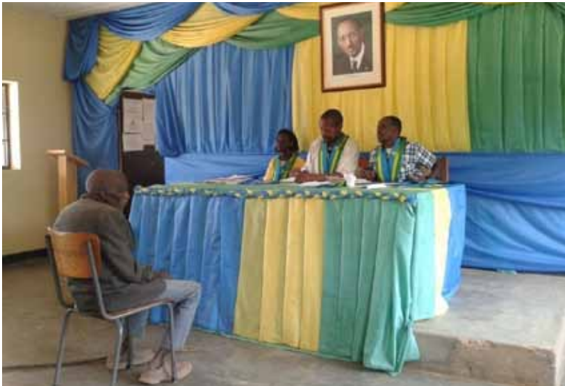
Hearing a witness during mediation, Southern Province, Rwanda