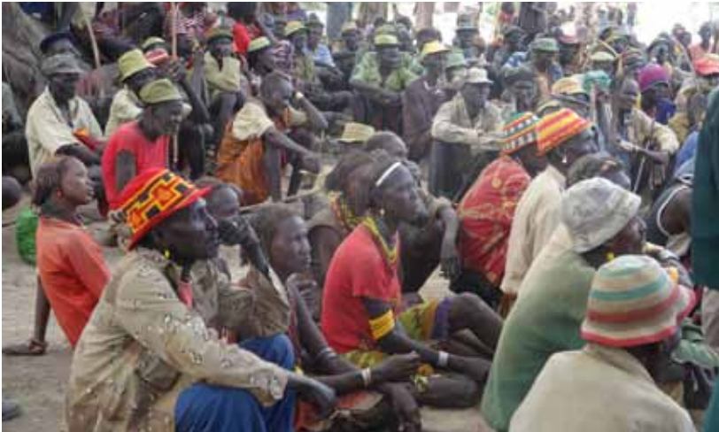
Nyangatom and Kara attending a government organized peace meeting in Kibish, Ethiopia (K. KASSA, 2014)

liticized context in which they are operating. Finally, a strong reliance of the state on coercive strategies in managing conflict overlooked the importance of customary mediation and negotiation, on the one hand, and has set a green light for further conflict and retaliation, on the other hand, for the reason that it lacked a therapeutic component of reducing conflict.