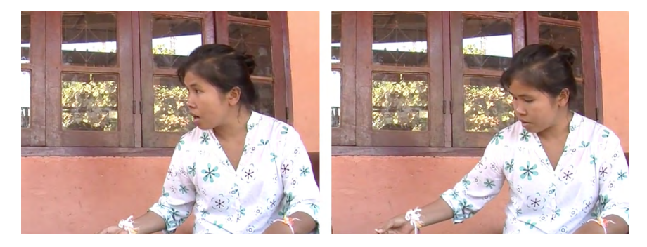
Figure 2. The speaker's facial expression during two different repair initiating turns (T0). The left panel illustrates a raising of the eyebrows during a repair initiator haa2 'huh?' and would be coded as "yes". The right panel illustrates no easily noticeable facial action and would be coded as "no".

Other-initiation of repair may come with facial displays such as a raising or furrowing of the eyebrows, squinting, or nose wrinkles (Ekman 1979; Wiener et al. 1972). These facial displays may start earlier or end later than the verbal component of the repair initiator.