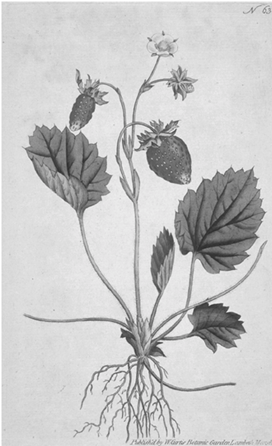
Fig. 1 Fragaria Monophylla by S. Edwards. From The Botanical Magazine 2 (1788).