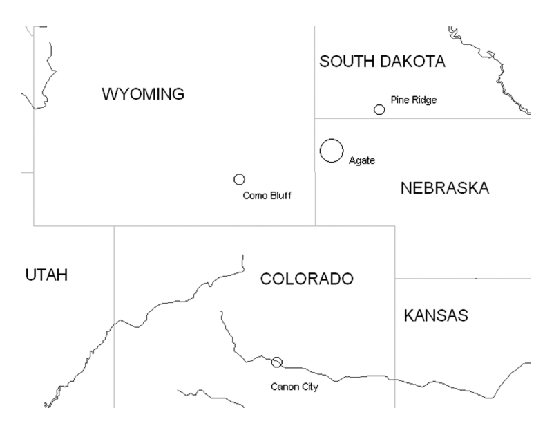
Figure 1. Map of the central interior western region of the United States, showing fossil field sites mentioned in the text. Map drawn by the author.

cases fossil hunters could simply prospect where they pleased, although fierce struggles to secure the best fossil beds continued among rival collectors. And they did also have to watch out for homesteaders, especially after the land policy changes of 1904, 1909, and 1916. If, during the course of their excavations, scientists suspected that new settlers might soon file claims on the land they were using, they had to take action. On the other hand, they could also attempt to use the same land laws elsewhere for their own purposes.