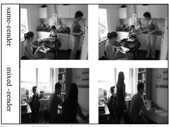
Figure 1: Still frames from the same-gender (all female) and the mixed-gender (two females; one male) video stimuli

The stimuli were presented on a computer screen. The addressees did not see the videos. Addressees were instructed that after each narrative, they could ask clarification questions. They were also informed that they would be given two short written questions about each narrative. The purpose of this was to ensure that the speakers included enough details in their narratives and that the addressees pay attention to the narratives. Once the instructions were given, the experimenter left the room and came back with the questions for the addressee after each narrative. The order of the two videos was counterbalanced. Each session was video recorded.