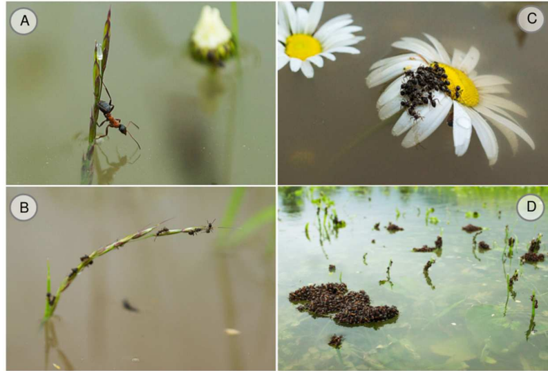
Fig 1. Impressions from the flood. A: Ant worker clinging to the tip of a grass blade. B: Several ant workers clinging to the tip of the grass blade. C: Group of ant workers on a Bellis perennis flower. D: Ant rafts.