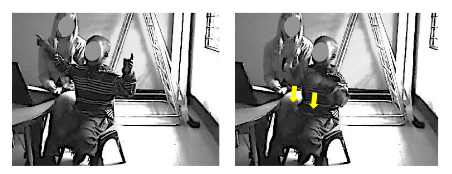
Two protagonists: 5 year old boy producing a two-handed stroke, a tomato man and a triangle man that fell in the water by moving both his hands down while saying "they both fell in the water from a cliff".