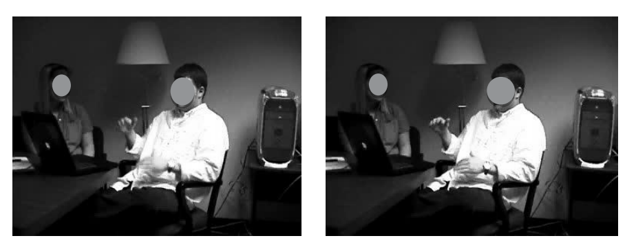
Two landscape elements: A male adult producing a both-handed stroke depicting the two different levels of the land by making his hands flat shape at two different levels, while saying "so you got your two different levels of elevation".

Figure 3. Examples of gesture and the accompanying speech in the four subcategories of two-handed stroke gestures. The bold face in the speech (in quotation marks) indicates where the stroke of the gesture occurred.