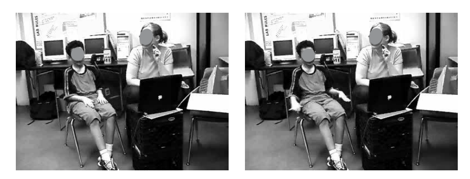
One landscape element: 9 year old boy producing a two-handed stroke depicting the flat land by horizontally swiping his right hand and the left hand from the midline to his right and to his left respectively while saying "which was on a low surface ".