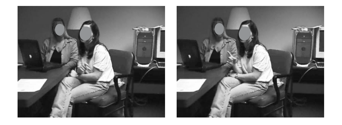
Figure 2. An example of a single-handed gesture.

Next, we coded the gestures into one of two categories: single-handed gesture or two-handed gesture . A referent of each representational gesture was determined by the content of the accompanying speech and previous speech context. The single-handed gesture refers to a gesture depicting or indicating one or two event components by a single hand. Figure 2 shows a female adult producing a single-handed stroke, depicting a tomato man that came to the scene and slid up the hill, by extending her index finger and moving it from the left bottom space to the upper right space, while saying "and the tomato just comes, and just slides up the hill ". The bold face in the speech (in quotation marks) indicates where the stroke of the gesture occurred.