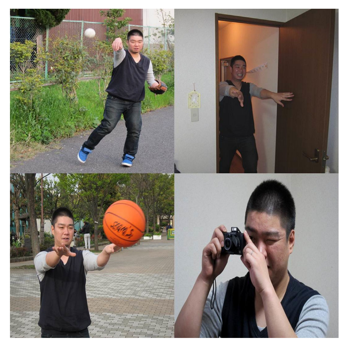
Fig. 2. The four photographs as response choices shown after the "throwing" gesture in Fig. 1 was presented (upper left, verbal-only match; upper right, gesture-only match; bottom right, unrelated foil; bottom left, integration match).

VG condition and G condition were taken from recordings in which the actor with the mask both spoke and gestured, and without the mask, the lip movement would have given participants information about speech in the G condition. In the final stimuli, the speech produced by the actor with a mask was not used because the speech was somewhat muffled. The audio part of the final stimuli was separately recorded by the actor. It is highly common in Japan to wear a mask of the type used in the stimuli to avoid catching a cold or hay fever, and thus children were familiar with people wearing a mask of that type. The gestures expressed eight common everyday actions (writing, throwing,