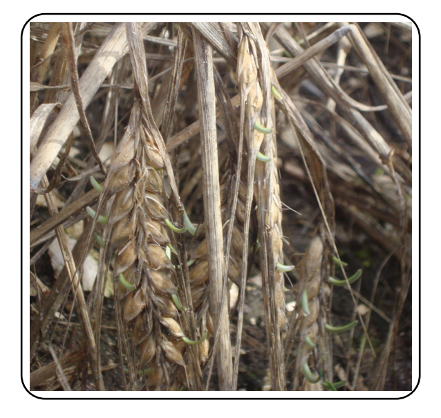
Figure 3 Preharvest sprouting in a barley field in the Netherlands observed on 1 September 2010. Seeds attached to their mother plant have germinated due to a combination of low dormancy and high humidity.

Primary dormancy is overcome by seed dry storage, also referred to as after-ripening. As a result of after-ripening, the window of