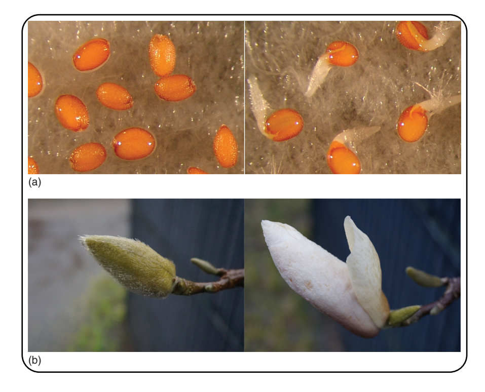
Figure 1 Dormancy in plants. (a) Seed dormancy in Arabidopsis. The photos show dormant (left) and fully after-ripened (right) seeds that were imbibed in the light for 3 days. (b) Bud dormancy in Magnolia. The photos show the same bud in a dormant (left) and nondormant (right) state. The photo on the left was taken on 3 February 2016 and the photo on the right on 30 March 2016 in Dansweiler, Germany.

Plants that are adapted to a specific location can still experience diverse environmental conditions from year to year. Therefore, seeds are able to sense environmental factors, like temperature, in order to release their dormancy at the right moment. It has, for instance, been demonstrated that the temperature that the mother plant experiences during seed maturation has a strong influence, with lower temperatures leading to more intensive seed dormancy (Kendall and Penfield, 2012). The adaptive nature of dormancy can also give plants some flexibility to set the timing of seed germination and bud flush to adapt to climate change.