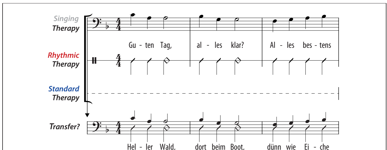
FIGURE 1 | Schematic overview of the experimental design. Three types of treatment were applied: singing therapy, rhythmic therapy, or standard therapy. In singing therapy , patients underwent training of common, formulaic lyrics by singing them to a well-known melody (“Hello, everything alright? Everything’s fine...”). In rhythmic therapy , patients were trained using the same lyrics, but rhythmically spoken with natural prosody. In

AOS, apraxia of speech; SD, standard deviation.