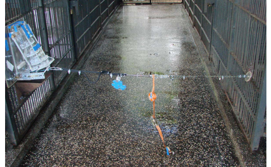
Figure 1 | Experimental apparatuses and setup. (a) Chimpanzees in the GO group (blue food box on left) could release a peg, allowing food to be shaken out, whereas those in the NO-GO group (green food box on right) would prevent food from being shaken out. (b) In the test conditions, recipients would sit in front of the food box (left of image) and actors would face them across a keeper's corridor (right); the peg was attached to the mesh of the actor's room (right).

been by-products of experimental designs, producing an illusion of helping in our closest living relatives.