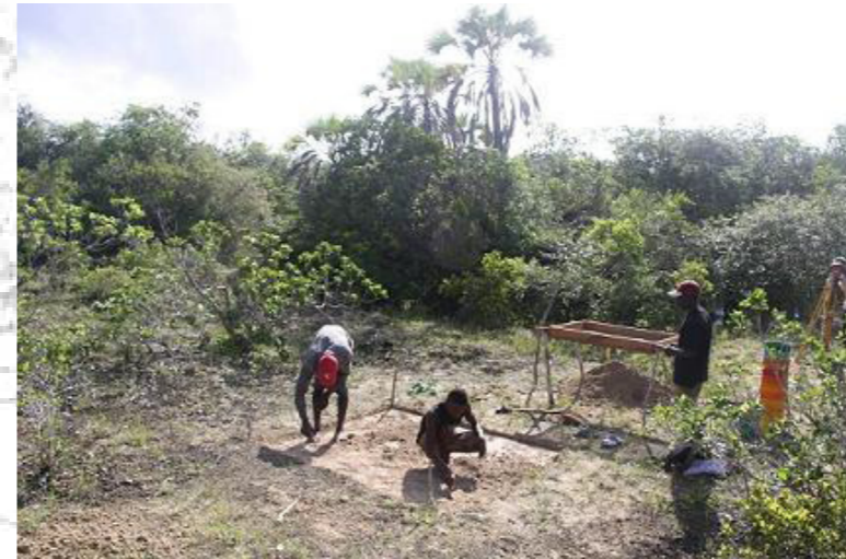
Sealinks field excavations, Kilwa region, Tanzania.