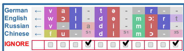
Figure 4: Aligning words in the EDICTOR

Defining which words in multilingual word lists are cognate is still a notoriously difficult task for machines (List, 2014). Given that the majority of datasets are based on manually edited cognate judgments, it is important to have tools which facilitate this task while at the same time controlling for typical errors. The EDICTOR offers two ways to edit cognate information, the first assuming complete cognacy of the words in their entirety, and the second allowing to assign only specific parts of words to the same cognate set. In order to carry out partial cognate assignment, the data needs to be morphologically segmented in a first stage, for example with help of the Morphology panel of the EDICTOR (see Section 4.2). For both tasks, simple and intuitive interfaces are offered which allow to browse through the data and to assign words to the same cognate set.