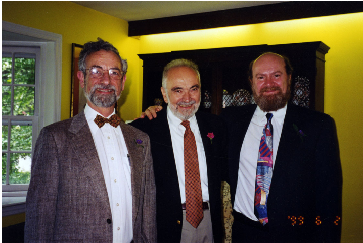
Fig. 7. Joel Lebowitz with Elliott Lieb (left) and Michael Aizenman.

causing the liquid-vapor transition is very large compared to the distances between the particles and any short-range interaction, but still very small compared to the size of the system [Penrose, Lebowitz 1971].