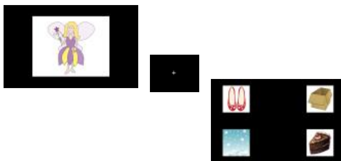
Figure 1. Example of stimuli used for the sentence comprehension task.

Offline tasks with a separate group of 4- and 5-year-old participants were conducted to establish that even younger children could recognize the objects and used the verbs to identify referents in the expected manner. Children were tested at the Ontario Science Centre. The experimenter showed the child a four-object display, provided a label, and asked her to identify the relevant object. 100% of children recognized all the images presented during the critical sentences ( N = 8 per target image). Children were then introduced to pictures of agents (e.g. 'This is Chloe the fairy'), following which they were presented with a four-object display, and asked (e.g.) 'What will Chloe eat?' Four- and 5-year-olds selected the only referent that was semantically plausible following the verb over 90% of the time across trials ( N = 16 per target image).