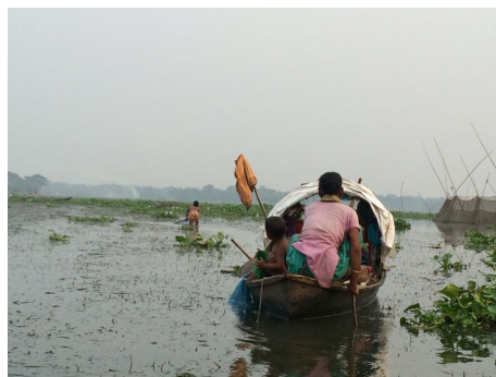
Fig. 3 Shodagor mother rows the fishing boat while her husband fishes for small prawns in waist-deep canal water. This mother was also responsible for cooking dinner, at the other end of the boat, and caring for the two young children on the boat with her. When the father's net is full, he and his wife will sort through the catch together