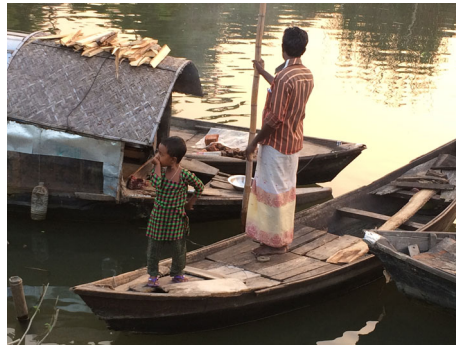
Fig. 1 Shodagor father takes his daughter to shore on their family’s country boat while his wife works away from home selling goods. Behind the father and daughter is their family’s houseboat with firewood piled on top that the mother will use for cooking

for 6 months of the year as primary caregivers of their children (Fig. 1). While their wives work outside of the home for half of the year, these men are responsible for all forms of direct care of children—holding, feeding, soothing, cleaning, protecting, etc. The exact amounts of time these fathers spend in particular activities is not yet known, but in no other recorded culture do a significant portion of the population of fathers forgo work outside the home in order to stay home and care for children.