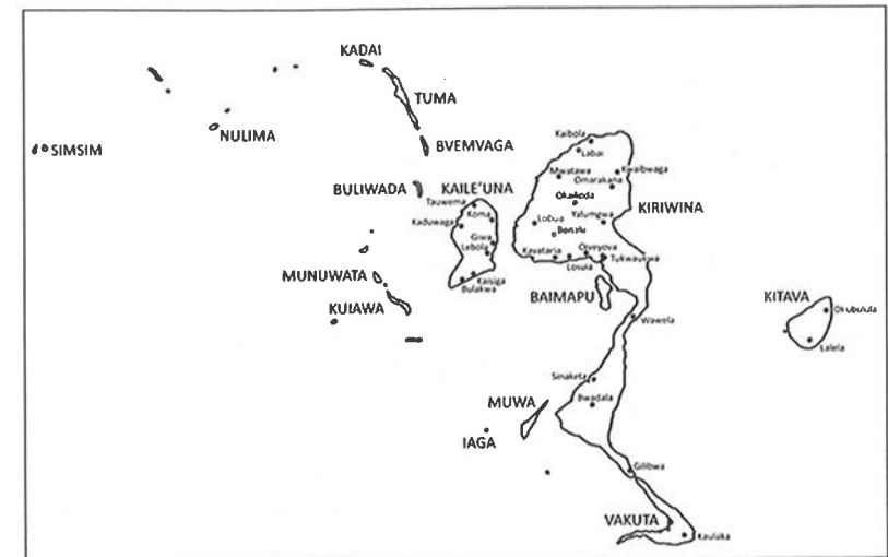
Figure 4.2: The Trobriand Islands

The Trobriand Islanders belong to the ethnic group called “Northern Massim.” They are gardeners, practicing slash and burn cultivation of the bush; their most important crop is yams ( Dioscorea esculenta ). Moreover, they are also famous for being excellent canoe builders, carvers, and navigators, especially in connection with the ritualized Kula trade, an exchange of shell valuables that covers a wide area of the Melanesian part of the Pacific (see Malinowski 1922; Leach and Leach 1983; Persson 1999). The society is matrilineal but virilocal.