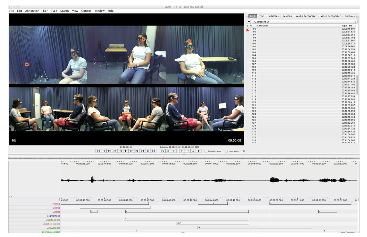
Fig. 1 Still image showing an extract from the multisource synchronised audio-video recordings (and annotation software ELAN) serving as the basis for the present analyses.

Gestures For each question, the occurrence of gestures was annotated (using the software ELAN 4.61; Wittenburg, Brugman, Russel, Klassmann, & Sloetjes, 2006). Gestures were defined as communicative movements of head or hand (and torso) that speakers produced as part of conveying the question (or the response); this included (a) iconic and metaphoric gestures (McNeill, 1992); (b) deictic gestures