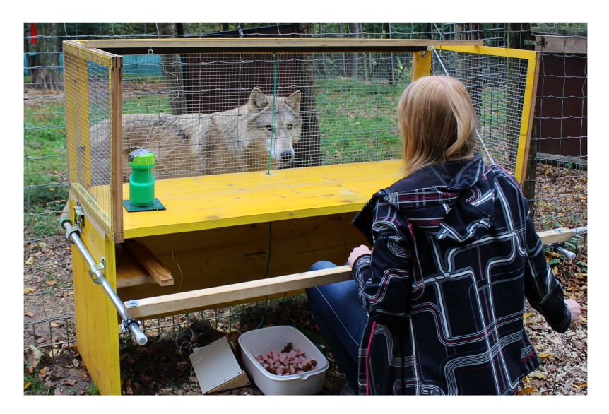
Figure 3. The experimental set-up of the test.

are sensitive to human communicative cues, and that the skills underlying this comprehension likely facilitated domestication. Moreover, we suggest that domestication has reduced the independent problem-solving abilities of dogs within the causal domain. Whether this has happened by relaxing selection on their causal understanding or on exploring objects, needs further research.