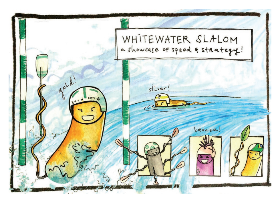
Figure 1 | Whitewater winner. Gold medallist, Vibrio coralliilyticus, flicks into first, overcoming a strategically diverse field of white-water slalom contenders.

developed by your Motile Marine teammate, Vibrio alginolyticus , right?