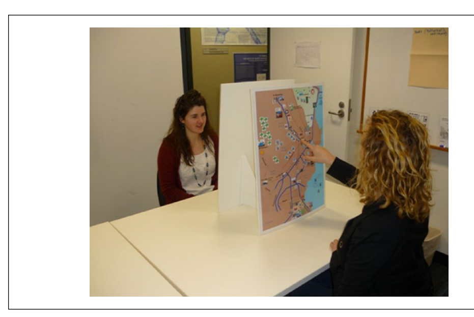
Figure 1. Experimental setup for map task.

the Caz, bikie, uggies). The target words were selected from a database of frequently used Australian hypocoristics collected in 2009 (Kidd et al., 2011). These target words were illustrated by a picture on the map and included in two scripts consisting of four journeys each.