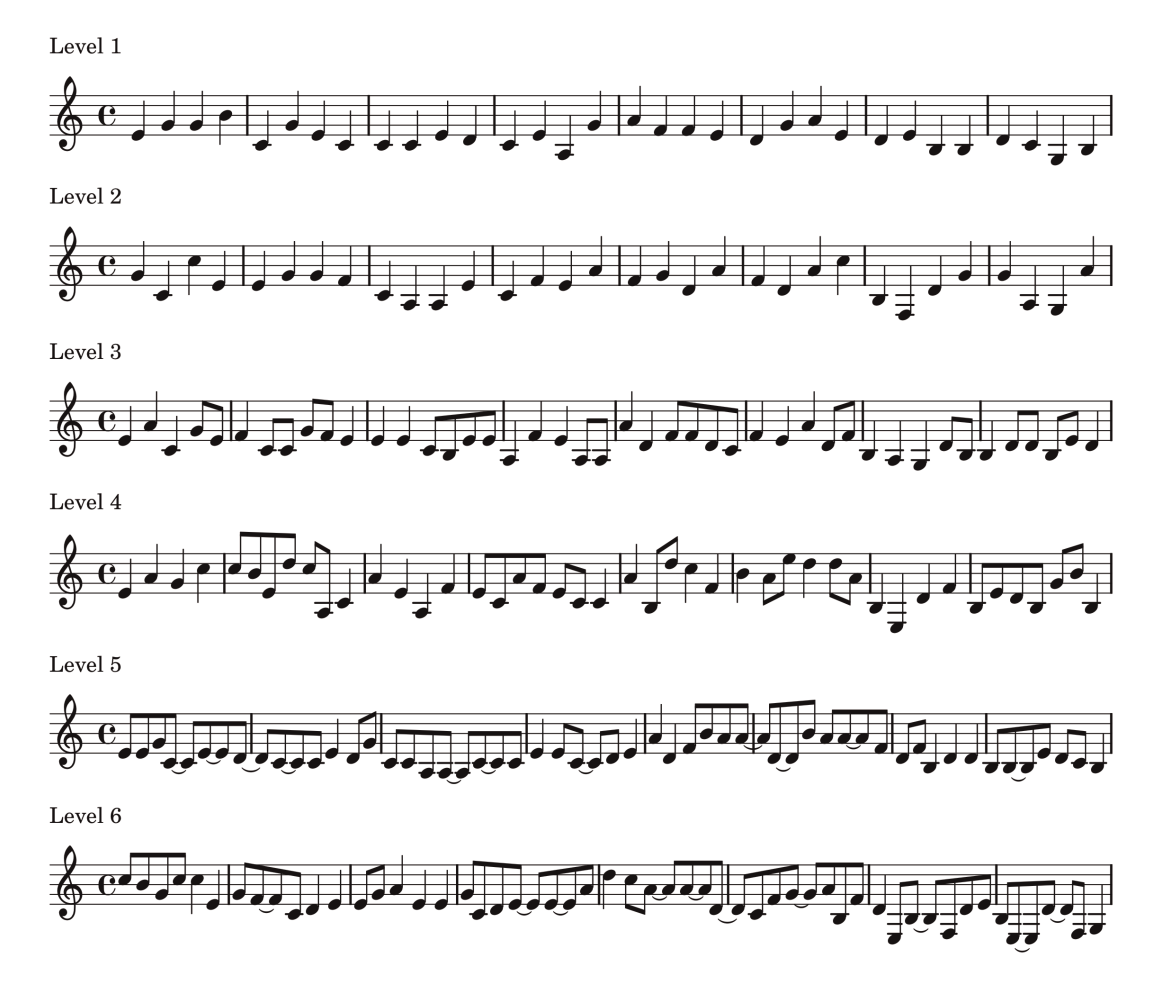
Figure 1. A musical score to illustrate the different levels of complexity for the melody lines of our stimuli. The musical sequences all modulate through two bars of C major, A minor, D minor and G7 major, respectively. doi:10.1371/journal.pone.0035626.g001

factor independent variable, and subject age (age), years of formal musical training (musical expertise), and menstrual cycle day normalised to a 28-day cycle (cycle day) were entered as covariates. Cycle day was normalised using each subject's current cycle length in days (calculated using the first and last day of each subject's current menstruation cycle), dividing 28 by the cycle length to create a correction factor, and then multiplying each woman's day in the cycle at the time of the experiment by this correction factor [32,33]. For example, a women with a 28-day average cycle length would have her current cycle day multiplied by 28/28 = 1 (not corrected), a women with an average cycle length of 40 days would have her current cycle day multiplied by 28/40 = 0.7 and hence, reduced. Pair-wise comparisons with Bonferroni adjustments allowed us to determine whether subjects rated the six different levels of musical complexity as significantly differing in complexity, and group the levels according to their perceived complexity.