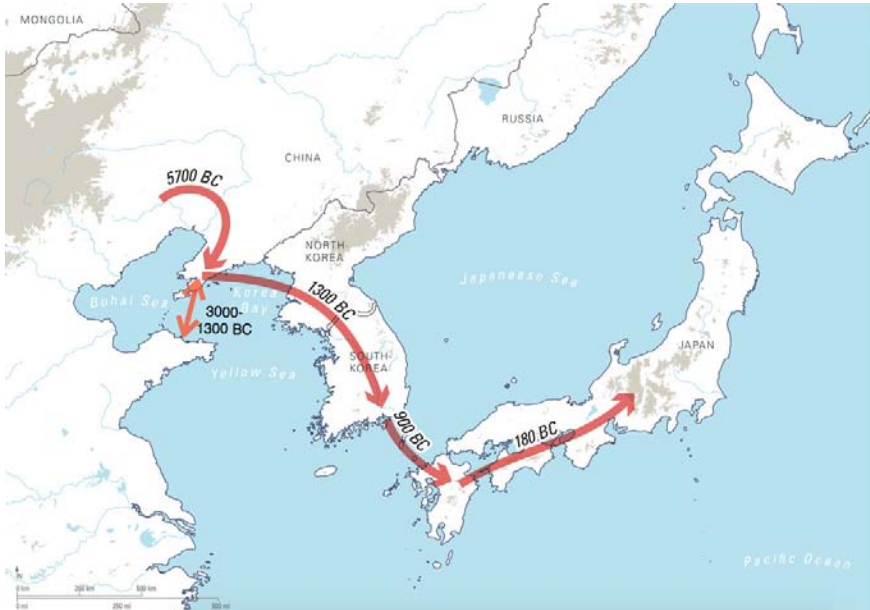
FIGURE 5 The spread of agriculture and language to Japan

The final spread of millets and rice into Japan is dated to the beginning of the first millennium BC, marking the beginning of the Yayoi period (1000 BC–300 AD). It is associated with an influx of farmers from the Korean Peninsula (Harunari, 1990; Nelson, 1993; Hudson, 1999; Crawford and Shen, 1998; Crawford and Lee, 2003; Harunari and Imamura, 2004; Barnes, 2015), who probably brought the Japonic language to Japan. Apart from rice, millets and various crops, Northeast Asian influences include pottery, stone and wooden agricultural tools, domesticated pigs, ditched settlements and megalith burials. It is clear that agriculture arrived in Japan as a “package” of Northeast Asian culture, even if this package had a southern, Austronesian-like touch. Wet-rice agriculture was ultimately derived from the south, and certain elements of Yayoi culture such as ritual tooth ablation (Han and Nakahasi, 1996: 58, Brace and Nagai, 1982: 405), tattooing with dragon figures to ward off monstrous fishes (Pauly, 1980: 82; Sasaki, 1991: 26–27; Solheim, 1993: 2; Bellwood, 1997: 108, 135; Oppenheimer, 1998: 77; Palmer, 2007: 51), and granaries with raised floors, curved roof-lines and gable horns (Pauly, 1980: 84; Waterson, 1997: 17; Arbi et al., 2015) indicate an Austronesian connection. As a result, the most parsimonious hypothesis, in my view, is the early, continental insertion of Austronesian elements into an essentially North East Asian cultural package, as illustrated in Fig. 5.