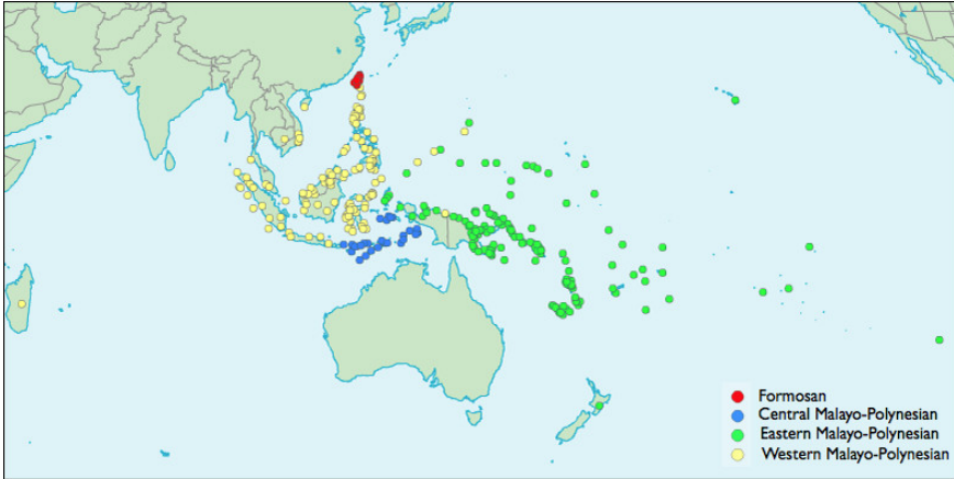
FIGURE 3 Map of the Austronesian languages (generated with WALS tool)