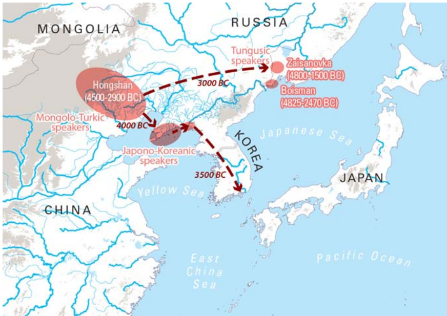
FIGURE 4 The eastward spread of millet agriculture in association with ancestral speech communities

Diamond and Bellwood (2003: 599) note that language families dispersed by agriculture, such as Indo-European and Austronesian, tend to spread more rapidly along east-west axes than along north-south axes because places at the same latitude are likely to share day length and seasonality and, thus, to be suitable for growing the same crops. The spread of millet agriculture, however, pushed the Transeurasian languages mainly in an eastward direction, into the Korean Peninsula and the Russian Far East. By contrast, the westward spread of the Transeurasian languages can be associated with nomadic pastoralism. The sudden desertification of the Hunshandake Sandy Lands of Inner Mongolia in 2200 BC made the western outlier of the Hongshan culture disappear in this region (Yang et al., 2015). The people moved westwards into ecologically transitional zones and eventually shifted from semi-mobile millet farming to pastoralism in the eastern Eurasian steppes. Equestrian pastoralism developed in the eastern steppes between 1200 and 700 BC (Taylor et al., 2017). The Xiongnu, a mixture of ethnic groups, some of which have been identified as ancestral speakers of the Oghuric branch of Turkic, ruled as nomads in that area between 209 BC and 155 AD. Therefore, the desertification of Hunshandake in 2200 BC may be associated with the separation and westward spread of the Turkic speakers. Later, in historical times, they accelerated their westward spread