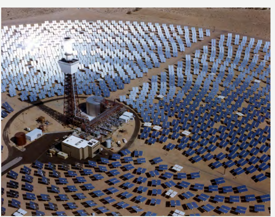
Power plant in Barstow, Mojave Desert, California, United States.

The societal and cultural implications of developments in the energy and resources sector are poorly understood. It is all too often visible that the humanities on one hand and natural and engineering sciences on the other hand live in different worlds. All too often, scientists spend little time outside the realm of their own discipline. In many cases, technically, this might work. But when it comes to challenges on historic and geo-historical scales, the lack of a broad historical perspective may also