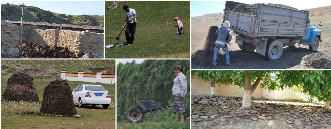
Fig. 1 Ethnographic images of dung collecting and drying. Upper left, drying bricked-up sheep and goat dung in a modern Kazakh winter camp in the Bryan-Zherek valley of eastern Kazakhstan, in the summer of 2011, when herds were pasturing in the mountains; upper centre, Uzbek herder and his daughter collecting cow dung as part of their morning routine near the Tashbulak archaeological site in 2015, eastern Uzbekistan; upper right, dung collectors from the more densely populated lower-elevation regions of Uzbekistan tak-

ing truckloads of sheep and goat dung from the mountain foothills to sell in markets in 2017, near the archaeological site of Tashbulak; lower left, yak dung heaps in Tibet along the route to Namsa lake not far from Lhasa, in 2010; lower centre, young Uzbek woman collecting cow dung outside Samarkand in 2013; lower right, gathered cow dung drying under walnut trees in a rural region of the Uzbek lowlands along the river Zerefshan in 2017