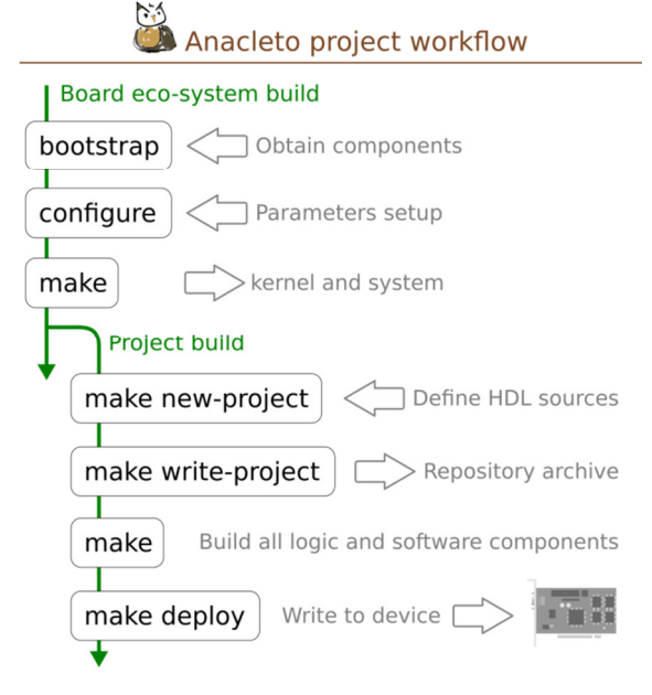
Figure 1: steps in building a new system.

Using this framework, a SoC FPGA application can be built from scratch by executing the general steps described in Figure 1: