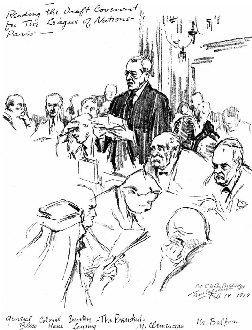
FIG. 4. Woodrow Wilson reading out a draft of the League of Nations covenant in the presence of Edward House (second from left), Paris 1919. Drawing by Cyrus Leroy Baldridge. Source: C. LeRoy Baldridge, "I was there" with the Yanks in France (New York and London: The Knickerbocker Press, 1919), n.p. Retrieved from Wikimedia commons.

“technical” body of the League of Nations. It is sometimes described this way—as a task-driven subcommittee, charged with sorting out practical problems of learned communication, bibliographic systematics, scholarly exchange programs, and the like. But it was never just that, and in fact only