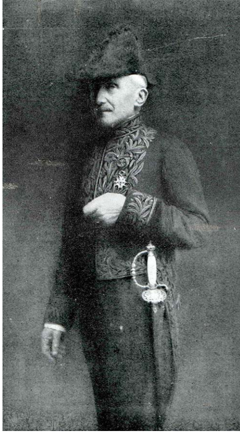
FIG. 1. Henri Bergson dressed for his reception into the Académie Française in 1914.

In this article, I want to demonstrate this trajectory, and the crucial impact of war diplomacy on scientific internationalism, by following the public statements of the French philosopher Henri Bergson (Fig. 1). Bergson was one of Europe's most prominent intellectuals of the time—not a working scientist, but scientifically very well-informed, and basing his views, particularly the ones relevant here, on biological understandings of life and evolution. 9 What is