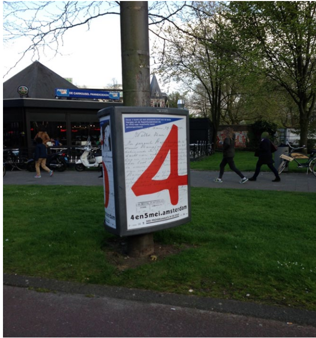
Figure 3. May 4 logo on lamppost along Silent March route.