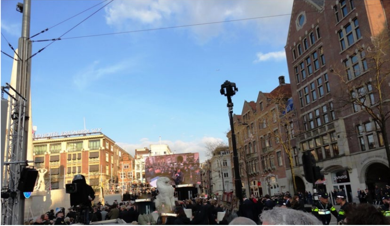
Figure 4. Media and security personnel visible at the Dam Square commemoration.