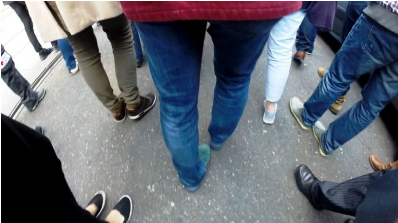
Figure 2. GoPro still of Silent March.